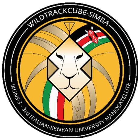
Fig. 2 Logo of the WildTrackCube-SIMBA