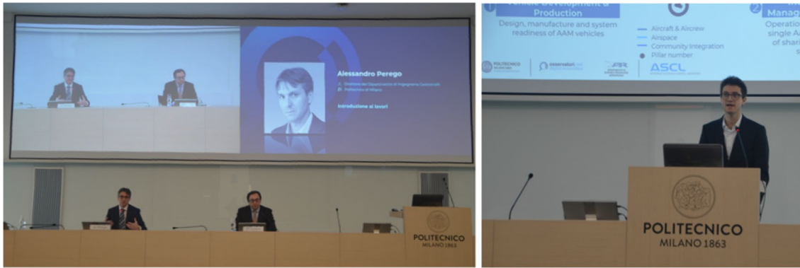
Fig. 6 Public conference of the Politecnico di Milano Drone Observatory