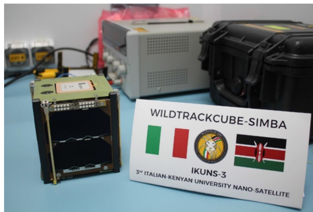
Fig. 5 The WildTrackCube-SIMBA satellite ready for integration