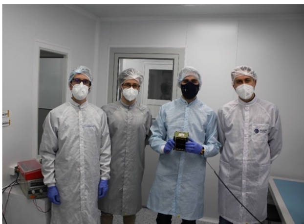
Fig. 3 The Sapienza students with the satellite in the integration site clean room