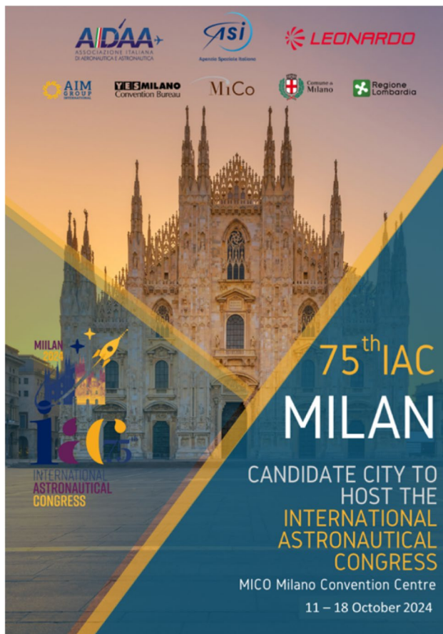
Fig. 1 Logo of the Candidate city for the 75th IAC