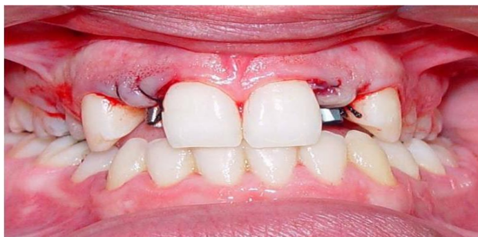
Figure 4: Facial view immediately after the insertion of two Abutment

Parents and professionals must often decide at a child's early age on how to cope with congenitally missing maxillary lateral incisors. Orthodontic treatment to create space for implants should not be initiated before the age of 13. This will avoid the potential for alveolar bone atrophy and the risk of relapse and subsequent retreatment.[3,4] The management of small restorative areas in the esthetic zone has posed significant problems for the implant and restorative team. The lack of bone available for the surgeon as well as the lack of restorative space available between the adjacent teeth makes tooth replacement with implants challenging for both the restorative dentist and the laboratory technician. In the past, patients with congenitally missing teeth or microdontia have been treated with resin-bonded bridges, removable retainers, or cantilever crowns to avoid the use of standard-diameter implants and prosthetics in this area.[1,3] The two common treatment options include orthodontic space opening for future restorations or orthodontic space closure utilizing the adjacent permanent canine teeth. With a paradigm shift in the patient expectations towards functional as well as esthetically appealing replacements for edentulism, the implant based oral rehabilitation has emerged as a sole winner in fulfilling all aspects of patient needs.[1,2,3,4,5]