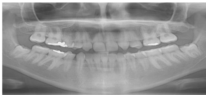
Figure 1: Pre-operative radiograph

The maxillary lateral incisor is the second most frequently missing tooth after the mandibular second premolar even though Muller et al. found that maxillary lateral incisors experience the most agenesis (not including third molars). Agenesis of the maxillary lateral incisor is also linked with anomalies and syndromes such as agenesis of other permanent teeth, microdontia of maxillary lateral incisors (peg laterals), palatally displaced canines and distal angulations of mandibular second premolars.[6,7] Absence of any tooth can cause treatment difficulties, but agenesis of the maxillary lateral incisor poses a unique set of restorative challenges. Because the maxillary lateral incisor is located in the esthetic zone, it is essential that bone height, papilla height, enamel color, and shape match the surrounding teeth. Clinicians attempt to maintain the proper anterior overbite, overjet and ideal interarch relationships of the canine teeth while creating enough space for a fixed partial denture or more commonly, an implant with a single crown restoration, but few treatment options are available for patients with agenesis of one or both maxillary lateral incisors. One option is to close the space(s) and restore the remaining teeth accordingly and the second is to open the space for a fixed partial denture or implant. [7,8,9,10]