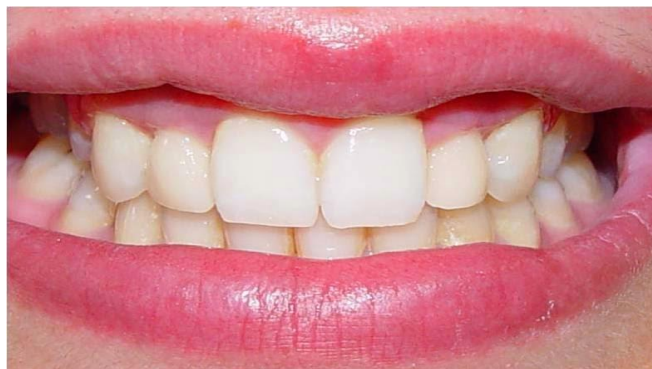
Figure 6: The implant-supported restoration after five years.

shape of the bone graft was adjusted to enhance its adaptation to the recipient site. Due to the limited extension of the flap and the orderly setting of the bone blocks, there was no need to use screws to secure the bone grafts in place.