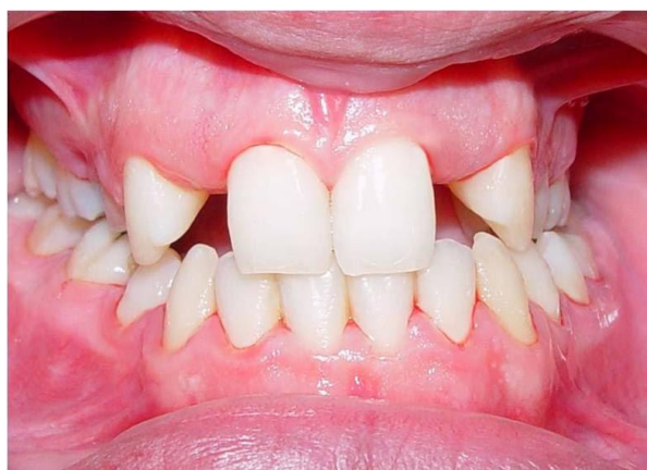
Figure 3: View of preoperative sites after the removal of orthodontic braces

They concluded that mutations in EGF, EGFR, FGF-3 and FGF-4 did not influence incisor-premolar hypodontia in the families studied. [14] Genetic factors appear to play a large role in tooth size and agenesis with the PAX9 and MSX1 mutations; however some authors suspect that the local environment is an important factor. [7] EGF, EGFR, FGF-3 and FGF-4 are not shown to be linked to incisor-premolar agenesis, but it is possible that signaling factors early in embryologic development may contribute to agenesis. Through the work of Pirinen et al. and Arte et al., it is evident that incisor-premolar hypodontia is genetically inherited, with strong links to other dental anomalies such as palatally impacted canines. Incisor-premolar hypodontia is an autosomal dominant gene inheritance with incomplete penetrance. [14,15]