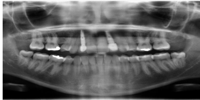
Figure 6: Post-operative radiograph

Classically, congenitally missing lateral incisors can be restored in three ways.[5] A camouflage treatment modality can be performed by mesialization of the canine into the lateral incisor space and performing conservative reshaping of the canine to mimic the incisor.[1,2] A second treatment possibility is a space opening orthodontic approach, aiming to create adequate space for the placement of an osseointegrated implant in the incisal area or to allow the seating of a fixed partial denture.[5] The third option is orthodontic creation of space in the posterior area to allow the placement of an implant in the premolar area.