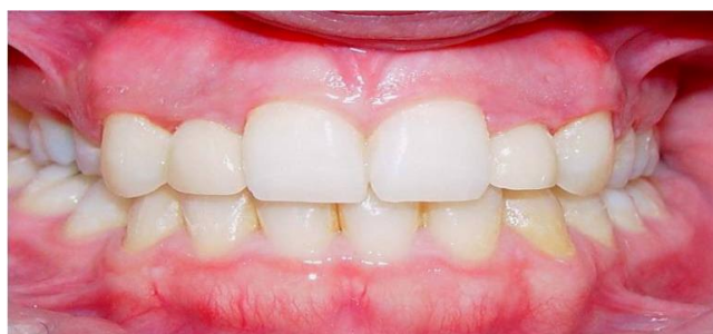
Figure 5: Zirconia crowns cemented

The orthodontist plays a key role in determining and establishing space requirements for patients with congenitally missing maxillary lateral incisors. However, the implant based treatment option in such patients requires an interactive and interdisciplinary management approach. [1,3,5] This interdisciplinary approach may involve preprosthetic orthodontic treatment following consultations with an oral surgeon or periodontist and restorative dentist to ensure orthodontic alignment will facilitate the surgical, implant and restorative treatment. Too often, surgeons attempting to place standard-diameter implants have forced the restorative team to manage these small dimensions with a lack of adequate prosthetics because of the size and diameter of the fixture head. Recently, manufacturers in the implant industry have offered a 3-mm diameter implant design to address these challenges. [3,4,5] Most of the implants available in the 3-mm size have been one-piece or unibody implants, which often necessitate conventional tooth-preparation techniques by the restorative team as well as standard cord-impression techniques for indexing the restorative margins. With some systems, there is no need for preparation due to a cervical marginal collar that can be captured utilizing a snap-in impression transfer.[16,17,18,19,20]