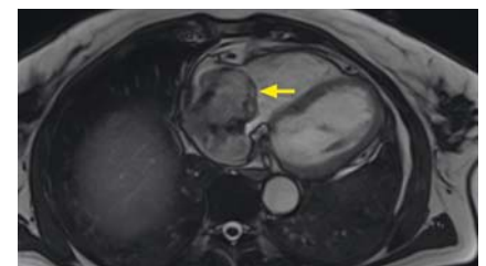
▶ Fig. 3 Magnetic resonance imaging of the right atrial mass.

examine the cardiac morphology before turning on the light in the endoscopic room.