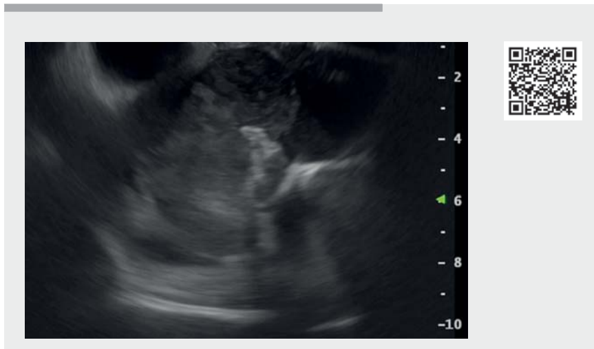
▶ Video 1 Accidental diagnosis of a right atrial mass during endoscopic ultrasound in a patient with intraductal papillary mucinous neoplasm of the pancreas and dyspnea.

A 70-year-old woman with a 10-year history of a 30-mm pancreatic cyst was referred to our center to continue follow-up. Of note, before the procedure she reported worsening dyspnea and fatigue over the last 4 months. However, no significant alterations were found on either preliminary cardiological or pneumological evaluation. Endoscopic ultrasound (EUS) confirmed the multilocular cystic lesion in the pancreatic body originating from the branch ducts, with focally thickened enhanced walls and a dilation of the main pancreatic duct (6 mm), as per a mixed-type intraductal papillary mucinous neoplasm (IPMN) with worrisome features. While withdrawing the echoendoscope into the mediastinum, a mainly hyperechoic 70×50-mm inhomogeneous mass was detected in the right atrium (▶ Video 1 ), with an extension towards the superior vena cava access (▶ Fig. 1 ). Owing to the suspicion of a cardiac mass, multimodality cardiac imaging