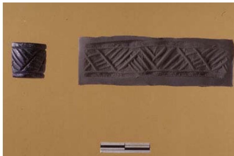
Fig. (2). Cylinder seal ( http://w3.uniroma1.it/arslantepe/amministrazione.htm ).

The cylinder was rolled over wet clay to mark or identify clay tablets, envelopes, ceramics and bricks. It covered an area as large as desired, an advantage over the earlier stamp