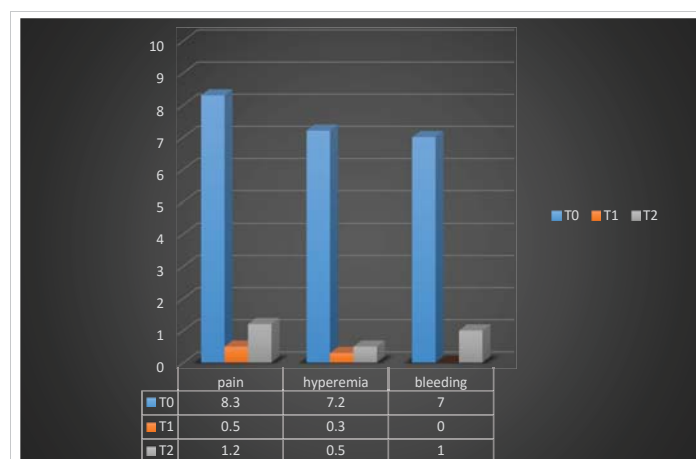
Figure 1: Improvement of bleeding before the treatment after the treatment at 90 days (T2). Improvement of local hyperemia before the treatment after the treatment at 90 days (T2).

Inflammation and oxidative stress are pathophysiological events that are closely related to each other. One of them may appear sooner or later, but when one emerges, the other is more likely to follow it and then both are involved in the pathogenesis of many disorders. Just as the inflammatory process can induce oxidative stress, the latter can cause inflammation by activating multiple pathways [36,37]. The result is that both inflammation and oxidative stress are associated with certain chronic diseases. In pathological inflammatory conditions, there may be an exaggerated generation of reactive species that can spread outside the cells, which induces localized oxidative stress and tissue damage. In addition, activated phagocytized cells produce large amounts of radical oxygen and reactive nitrogen species. At the onset of inflammation, infection or tissue damage is perceived by pattern recognition receptors such as Toll-like receptors (TLRs), NOD-type receptors (NLRs) and the receptor for advanced glycation end products (RAGE). The stimulation of these receptors by binding to specific molecules leads to the activation of transcription factors such as the nuclear factor