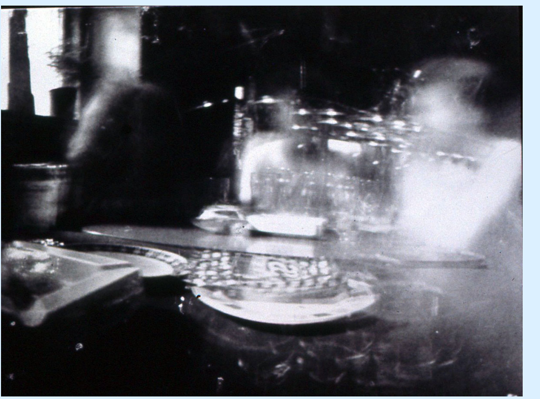
The Crown, Pinhole photographs, 10 inches by 8 inches, 1981

Field and Observer Perspectives in Autobiographical Memory, Eich et al, 2011, p2