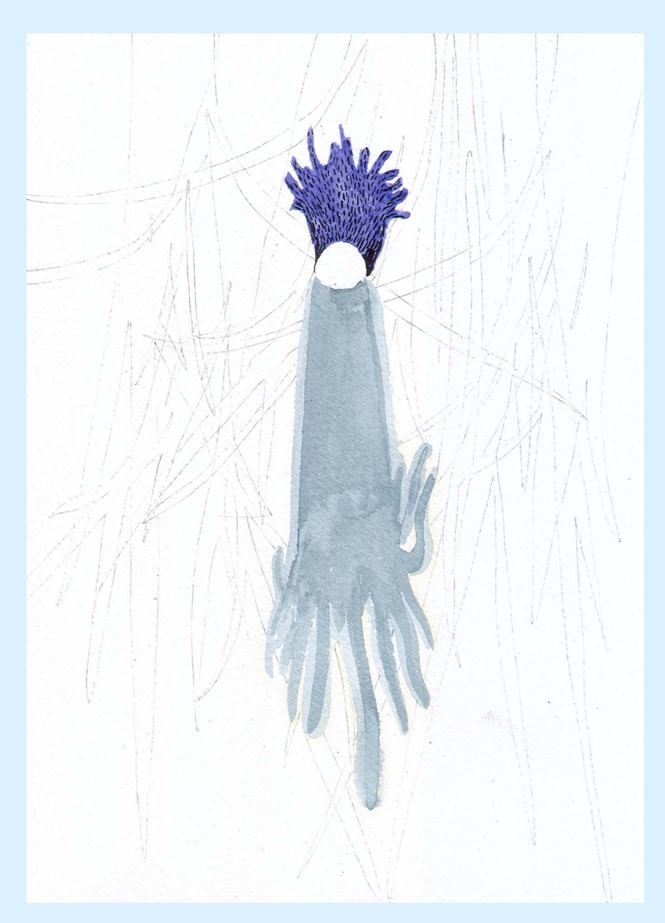
Second generation of memory paintings