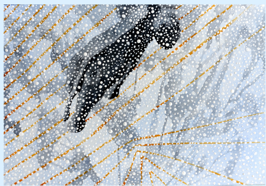
Three generations of memory paintings