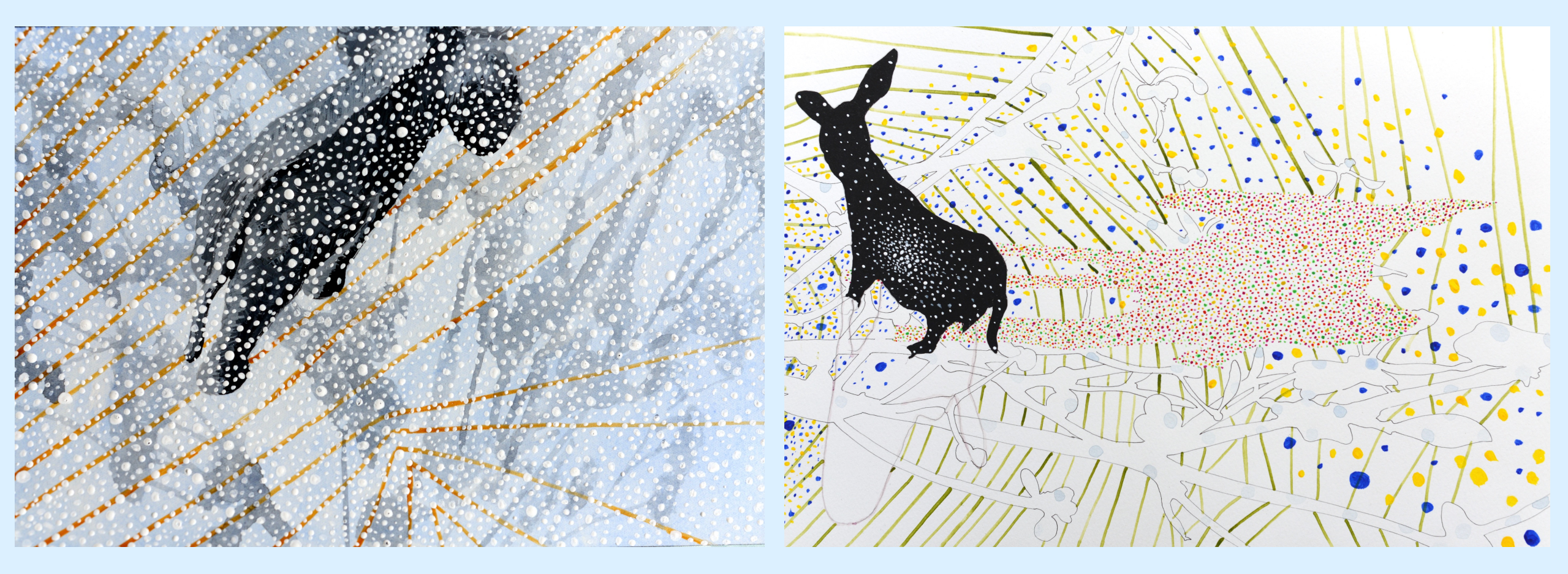
Third generation of memory paintings