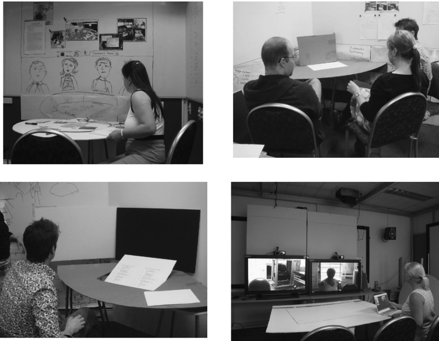
Fig. 4. Iterations of full-scale mockups of Blended Interaction Spaces.