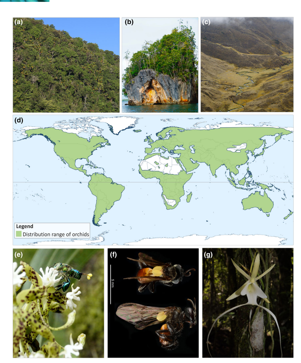
Fig. 1 Diversity of orchid habitats (a–c), modern distribution range (d) and pollination systems in Orchidaceae (e–g). (a) Tropical cloud forests; (b) Tropical lowland wet forests; (c) High-elevation grasslands; (e) the Neotropical epiphyte Cycnoches guttulatum Schltr., pollinated by male euglossine bees collecting aromatic compounds; (f) Trigona bee carrying a pollinarium of a Neotropical Xylobium elongatum (upper panel: dorsal view; lower panel: side view); (g) the epiphytic and leafless Dendrophylax sallei (Rchb.f.) Benth. ex-Rolfe., a Neotropical orchid pollinated by moths.

including 23 species sampled from type material and silica-gel dried tissue (Supporting Information Table S1).