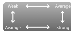
Figure 3. The team composition should avoid only consisting of students on same level

Some structures of Cooperative Learning support discussion in teams, while others aim at assisting in sharing knowledge, gaining knowledge, evaluating and rating concepts, or simply delegating specific tasks. “Meeting in the middle”, “Roundabout feedback”, “Role brainstorming” and “Value lines” are just some of the approximately 50 structures of Cooperative Learning [9] that could be activated in the course. In addition to imposing the learning structures onto the students, the composition of the teams should also be carefully carried out. Heterogeneous or multidisciplinary teams are emphasised in order to spawn better and richer discussions. This fits well into the agile processes, as software development teams working with agile methods are often multidisciplinary and stresses the importance of diversity in the team.