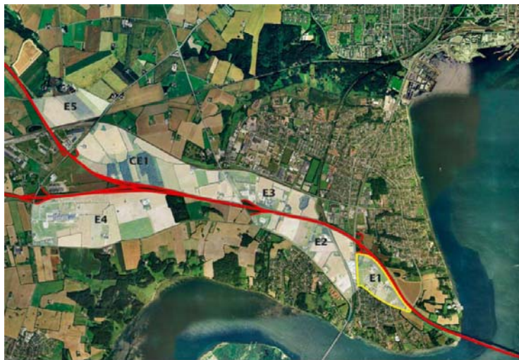
Air photograph: DDO, copyright COWI

a broad political anchoring of this project – both internally in the municipality and externally through transversal and informal cooperation with regional and national spatial policy-making and planning actors.