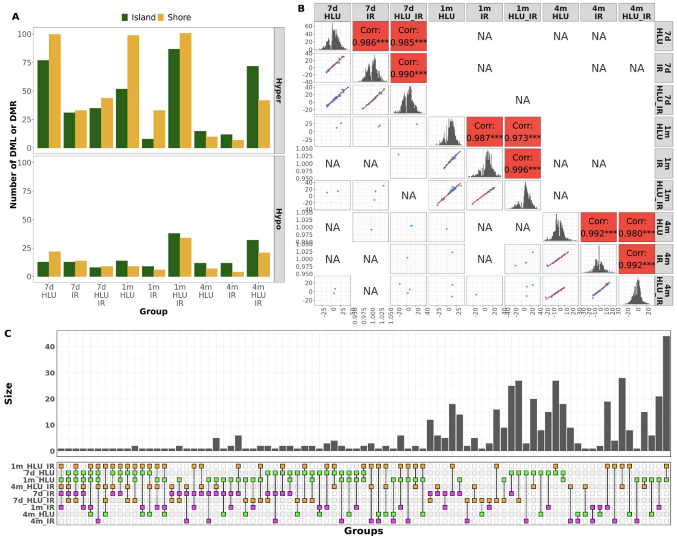
Figure 2. Differential methylation in exposure groups. (A) Total number of differentially methylated loci and regions within genes with hyper- or hypo-methylation in each exposure group categorized by whether they overlap with known CpG islands or shores. (B) Pairwise correlation plots for common differentially methylated sites. Differentially methylated loci (DML) with an adjusted p -value \leq 0.05 were selected from each of the nine groups and pairwise correlation for methylation difference was plotted for any given pair. The diagonal shows distribution of methylation difference (%) between exposure and matched control group. Pearson correlation value and significance are displayed on the right of the diagonal, and scatter plots with methylation differences for common DML from any two given groups are displayed on the left. Only significant correlations ( > 3 shared DML and p -value \leq 0.05 ) are displayed. (C) Upset plot showing differentially methylated genes (DMG), defined as genes with their promoter or gene body containing a DML or DMR (adjusted p -value \leq 0.05 , |methylation difference| \geq 10\% ), shared between at least two of the nine groups. The Y-axis represents the number of genes in a given intersection set. The X-axis lists different intersection sets and is ordered by the number of intersecting groups in a given set. Dots are colored by exposure condition (magenta for IR, green for HLU, orange for combination). R package MethylKit was used for differential methylation analysis, genomation and GenomicRanges were used for annotation of DML, and ggplot2 , ggpairs and ComplexUpset were used for visualization. DML/R/G differentially methylated loci/region/gene, HLU hindlimb unloading, IR irradiation.

HLU groups at 4 months ( mt-Co2 ; up-regulated). mt-Co2 is in the mitochondrial inner membrane and is an essential subunit of cytochrome c oxidase, the terminal component of the mitochondrial respiratory chain 19 . An integrated analysis of mammalian spaceflight data has reported the kidney to show an induction of mt-Co2 20 .