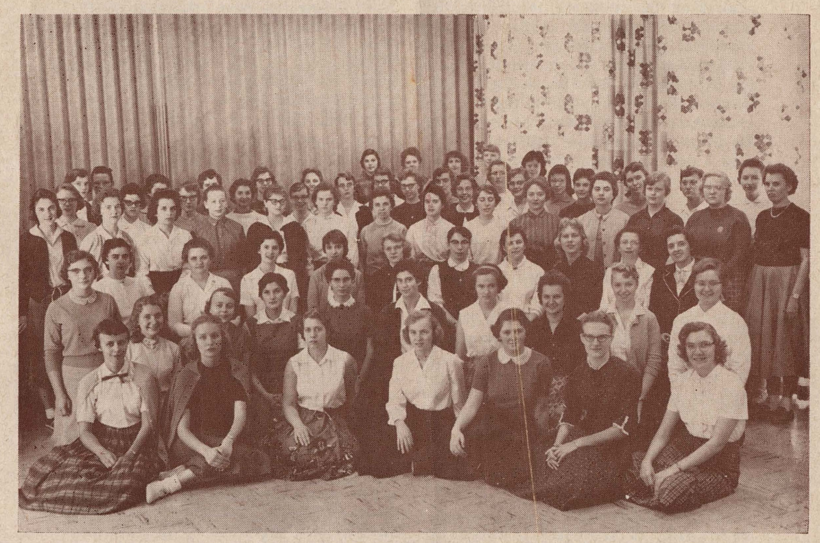
Above you see the present Deaconess Student Group, the largest Deaconess Student Group ever to be assembled in the Lutheran Church-Missouri Synod and affiliated Synods. For description of this group see page 3.