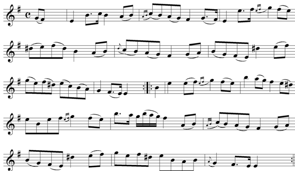
Fig. 2. ' Roselana Castle ', Caledonian Pocket Companion , vol. 4, p. 3.

Burns here identifies a folksong melody which has a relation in instrumental tradition. He knew the tune he calls 'Roslin Castle' in volume 4 of Oswald's Caledonian Pocket Companion . 8