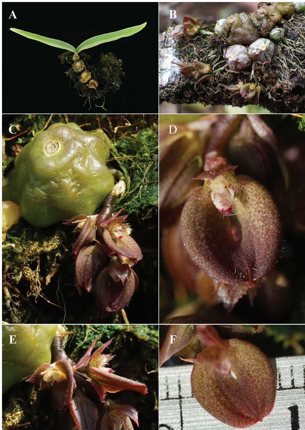
Figure 2. Bulbophyllum romkloense Pingyot & Thawara in vivo A habit (vegetative stage) B habit (flowering stage) C pseudobulb with inflorescence arising from the base D flower, front view E flowers, side view F lateral sepals.