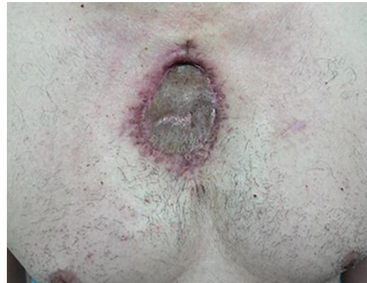
Fig. 4. Eight weeks of postoperative picture after applying full-thickness skin graft.

Long-term follow-up is essential in DFSP cases due to its potential for local recurrence. Although rare, distant metastasis has been reported in some cases (2–5%) [21]. Our patient will be closely monitored for any signs of recurrence or metastasis.