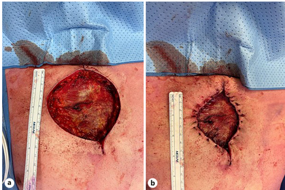
Fig. 2. a Intraoperative picture after the lesion excision. b Intraoperative picture after undermining and minimizing the defect size.