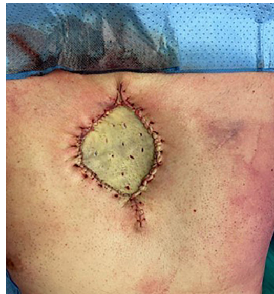
Fig. 3. Intraoperative picture after applying full-thickness skin graft taken from the groin to cover the defect.

hospitals. In our case, the patient underwent wide local surgical resection, ensuring complete removal of the tumor. The surgical margin in DFSP should be assessed at macroscopic (intraoperative) and microscopic (histology) levels. The European consensus-based guideline suggests utilizing 3-cm safety margin [18]. However, several variable safety margin cutoffs have been suggested in the literature [19, 20]. In our case, we opted for a 2-cm safety margin and the histology results reported clear margins. Adjuvant radiotherapy was not deemed necessary due to the absence of high-risk features.