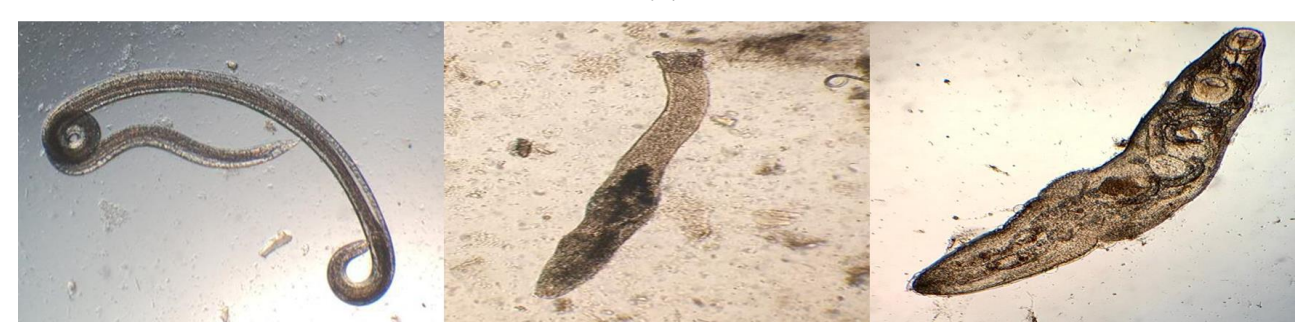
Figure 2. Anisakis sp. larvae (A), Bucephalus sp. (B), and Lecithocladium sp (C). in the intestines of C. bajad (Forsskål, 1775).