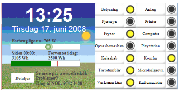
Figure 2: Visualizing speed, comparing and remembering.

Interaction based on these three concepts has been designed for a medium screen solution to be placed at fix points in households at the choice of the individual family. The final outcome (a result of several sketches and dialogues with software developers) is presented in the figures two, three, and four: To make the display nice and decorative the background changes twice a day from day to night and vice versa. A clock adds functionality and invites to also perceive actual consumption. The clock offers a combination of feedback and time providing a sense of the rhythm of consumption – becoming aware of when the household is ‘speeding’ or ‘crossing the norm.’