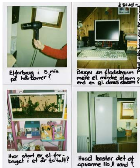
Figure 1. An example of polaroid-photos with written questions. Top-left: “consumption in five minutes for a hairdryer?”, Top-right: “Does a flat-screen use more or less power than the good old computer-screens? The total consumption for the PC as a minutes price”. Low-left: “how big is the electricity consumption for one year in total?”, Low-right: “What is the price for heating 110 litres of water?”..

Finally, the authors asked for permission to take a photo of the family members on the location where they were most wanted information about their electricity consumption. Four families chose the house computer, two families chose the refrigerator, and two families chose the meter in the utility room.