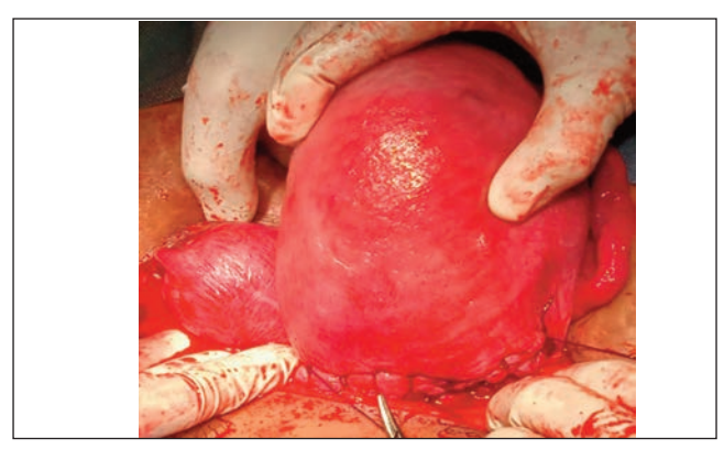
Figure-2: Left side: Small non-gravid uterus, Right side: Enlarged gravid uterus after surgery.

Caudal duplication syndrome: A rare entity 574