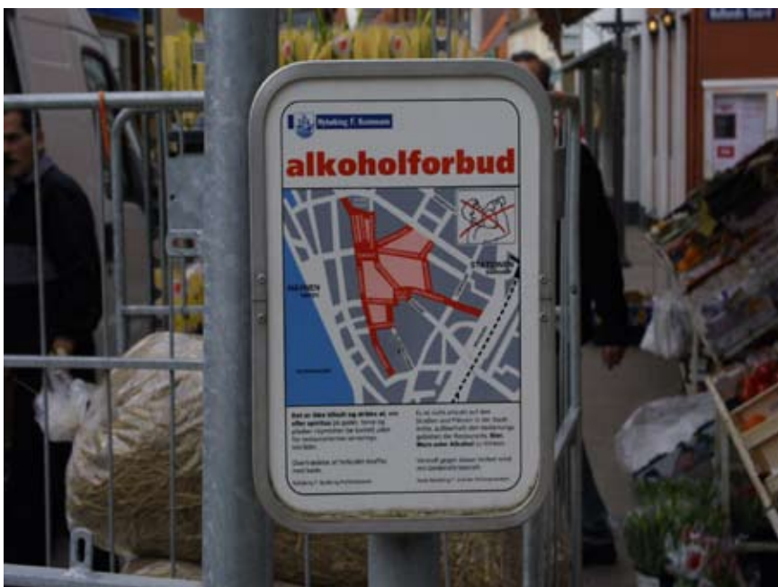
Many cities ban alcohol consumption, which means people cannot sit on a bench and drink where in contrast users are allowed to drink in cafés and restaurants. The police rarely enforce this prohibition. The sign shown prohibiting the use of alcohol is in the centre of Nykøbing Falster.

The freedom to choose safe routes and have alternatives when moving about the city is crucial to the perception of safety. Good lighting is especially important in this regard. When discussing safe routes, a distinction should be made between necessary and optional movements. Focus on lighting is particularly important in areas that people have to use, for example, areas connecting central functions in the city such as the railway station and shopping zones. Other routes are chosen freely as shortcuts – a narrow alley, a deserted square or a dark park – places they do not need to