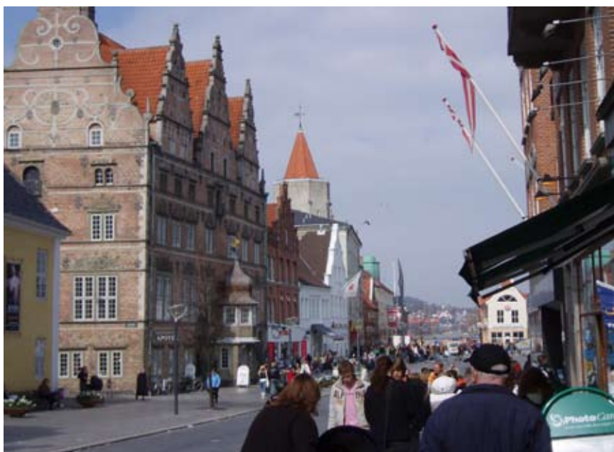
Bispensgade and Nytorv are streets where people meet before going out for a night on the town. Nytorv is a regional traffic hub and the terminus for many regional bus routes.

loud and moves around which is often a reason that other users feel unsafe. However, the users interviewed did not find Bispensgade an unsafe place to be. It has good street lighting, and the shops are also lit up after normal opening hours. Nonetheless, there are a few narrow alleyways and niches where people can hide, and this can generate a sense of unsafety.