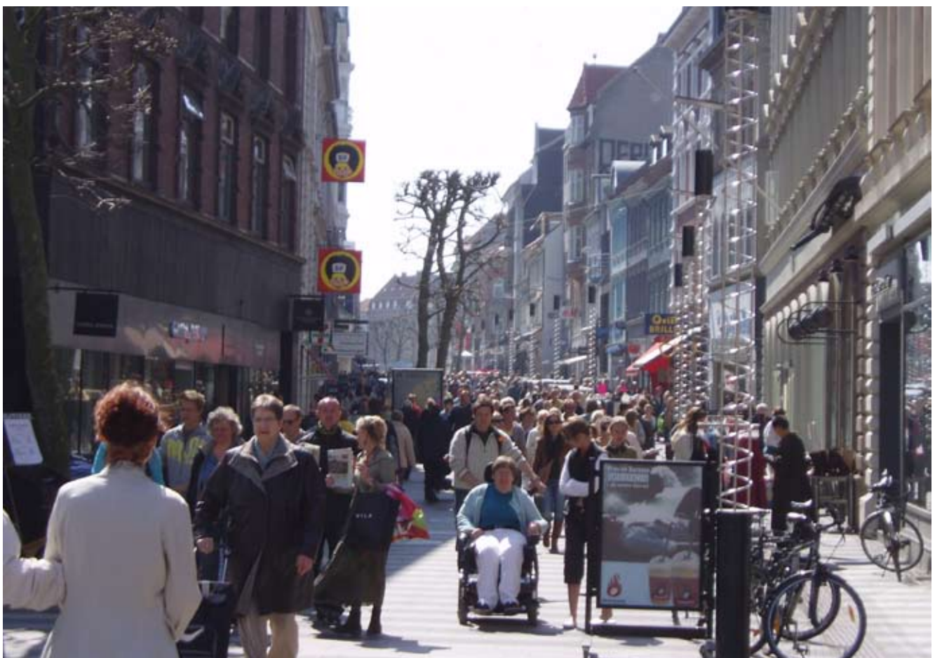
Urban success increases the use of the city's various places and spaces. This results in greater wear and tear, which requires ongoing maintenance, repair and renovation. Shown here, Søndergade, the main pedestrian street in Århus.

Conceptually, multifunctional urban spaces are designed to meet the need of all users. However, urban planners often have specific users in mind, and some work consciously to design urban space that appeals to selected groups. For although the general goal is to provide flexible, diverse and multicultural space, creating 'common space' is difficult in a time where