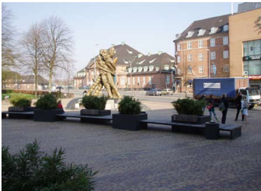
The railway station square is used mainly as a transit space.

tian Andersen on his travels, a sculptural interpretation by an artist; Bjørn Nørgaard. The square has an underground car park. The area acts primarily as a transit space and a short stay zone, for example, when people stop to read the wall newspaper on the façade of Fyens Stiftstidende's new media house. The interviewees generally feel safe using St Hans Square and the railway station square.