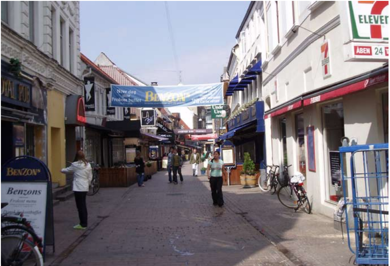
Popular urban areas are not popular with everyone. Residents' desire for peace and quiet conflicts with the nightlife fuelled by the entertainment options in the neighbourhood. Shown here: Jomfru Ane Gade in Aalborg.

individuality is valued and marked by different and changing needs.