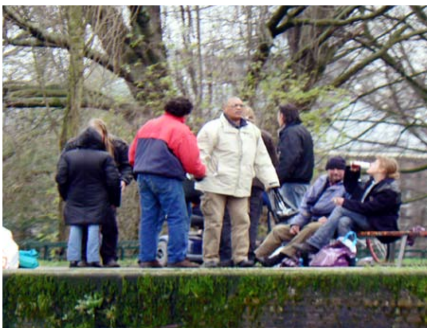
Marginalised groups, including the homeless, feel unsafe about occupying city squares, which are 'home' to them. Local authorities take different approaches to handling this group of users, but no one claims to have found an ideal solution.

Some cities have experimented with setting up shelters for marginalised groups outside the city centre, and consider that a good solution. Others see marginalised groups as part of city life and have attempted to design space with them in mind. Thus local authorities have different views on where it is most appropriate to designate space or shelters for marginalised groups. One view is that it is better to keep them in the heart of the city, because an urban core is better equipped to handle many different kinds of people. Alternatively, some decision-makers focus on moving 'problem' groups out of the city centre.