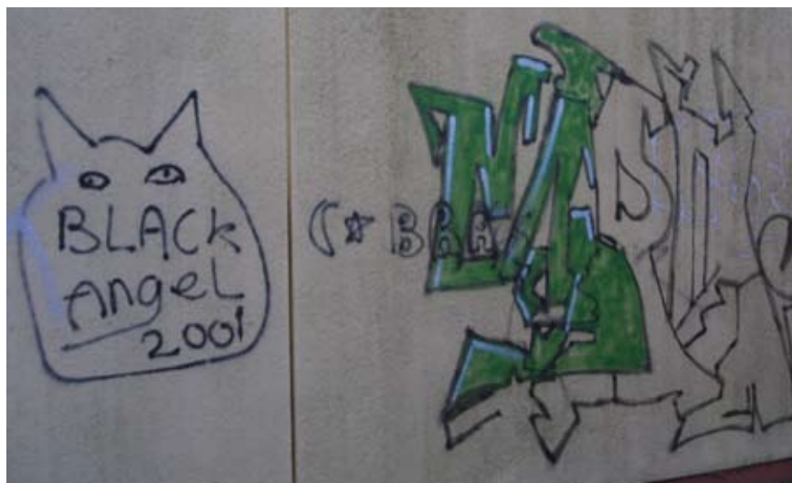
Vandalism and graffiti make many people feel unsafe. Neglect reinforces the feeling that the area is unsupervised.

SSP (formalised local cooperation between the schools, social services and police) cooperation.