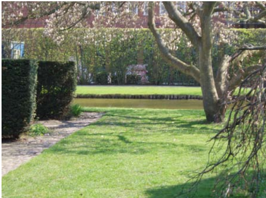
Drug dealing is one of the activities that go on behind the tall hedges of Kongens Have, Odense.

St Hans Church and Marie Jørgensen's School are located on St Hans Square. Between the church and the school is a car park used by the schoolchildren's parents, churchgoers and others. Parents have complained that the presence