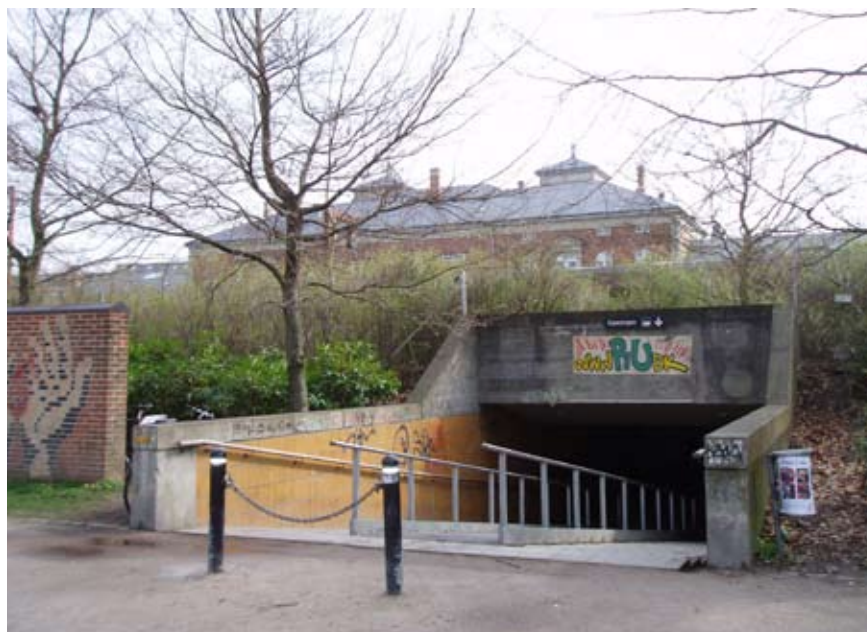
This dark tunnel connects a park with the railway station in Aalborg. Pedestrian traffic is heavy during the day, but at night the area is deserted and some people hesitate to use the tunnel.

Overall, the users who were interviewed in the study felt safe moving about the city. They cited 'personal familiarity with the area' as one of the most important elements of feeling safe and secure. Users expressed that the time of day has a major impact on how safe they feel, and that darkness alone gives a feeling of being