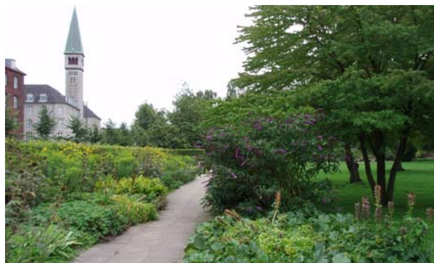
Although Enghave park is a green oasis in the city, it is a place some nonetheless avoid.

older people visit. In the evening, the users are groups of young people who have arranged to meet in the park. The park is often subject to vandalism and used by dog owners who organise dog fights there. There is a brisk trade in cannabis as well. Patrons of the nearby night club Vega often cause trouble here. The life that unfolds in the park in the evening makes many local residents feel extremely unsafe. Immediately adjoining Enghave park is a square, primarily used by beer drinkers who come every day. A circular hedge partially screens the square, hiding it fairly well from passers-by. The square is described as a safe place during the day but less so in the evening.