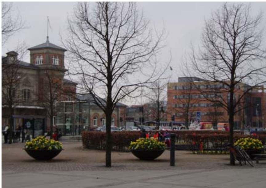
Kennedy Square is primarily a place used by the city's marginalised groups.

Bispensgade is a busy shopping street with speciality shops and cafés that bustle with life. It is a place where people stroll, shop, watch life pass by and observe the city. Jomfru Ane Gade, a side street to Bispensgade, boasts many restaurants and discotheques, popular places frequently