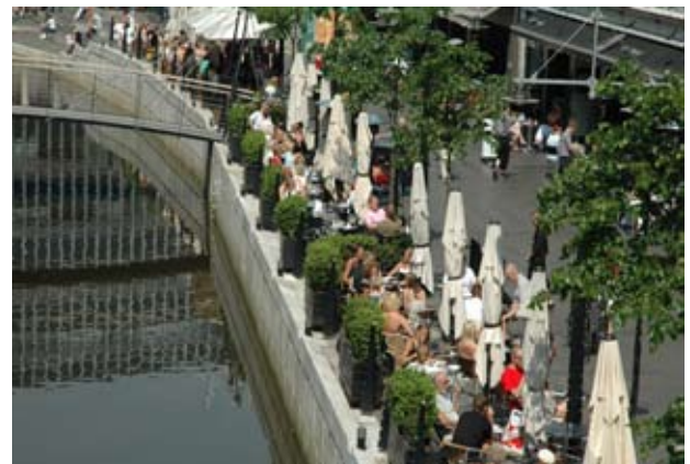
Although we use the city differently depending on our norms and values, we often have the same objective. Shown left, a pub in the Østerbro quarter of Copenhagen. Shown right, Vadestedet, a café and restaurant area in Århus.