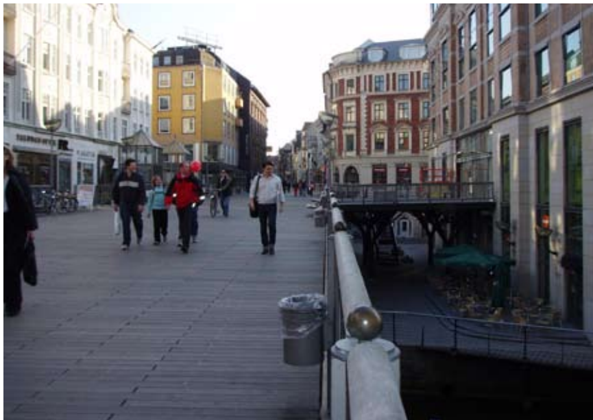
St Clemens Bridge affords a good view of city life by the river, but many people are deterred from using the area under the bridge because they cannot see what is going on.

When Århus Å was uncovered at the end of the 1990s, a special city area – Vadestedet – was created on the section from Immervad to St Clemens Square. Vadestedet houses a wide array of restaurants and cafés, with the focus on providing opportunities for outdoor activities in summer. The area attracts tourists and locals alike. The clientele changes several times over a 24-hour period: during the day business people eat lunch here, in the evening young families out for dinner are the main users, followed by university students enjoying a café latte or a beer. Around 10 pm the students go home, and the slightly more 'hard core' user group takes over. It is only after 10 pm and into the night that problems arise. From end-May to end-June and again from mid-August to end-September, police are on special alert in the area