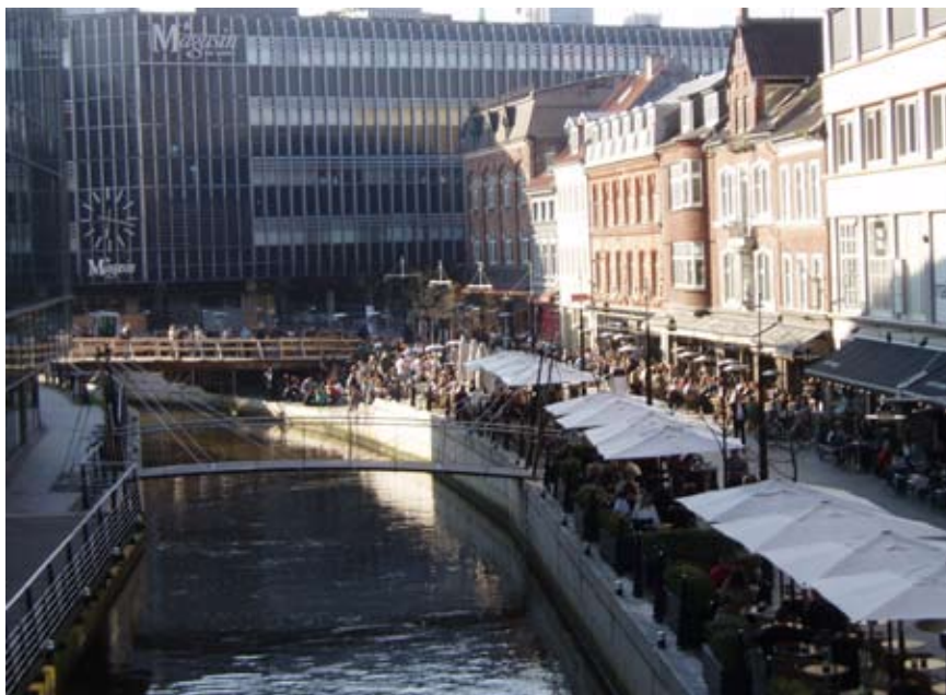
Cafés and restaurants one after another at Vadestedet.

insecurity'. The crime rate is fairly low relative to the large number of people in the area. Users describe the area around Vadestedet, St Clemens Square and St Clemens Bridge as a safe area and with 'good places' for passing the time of day.