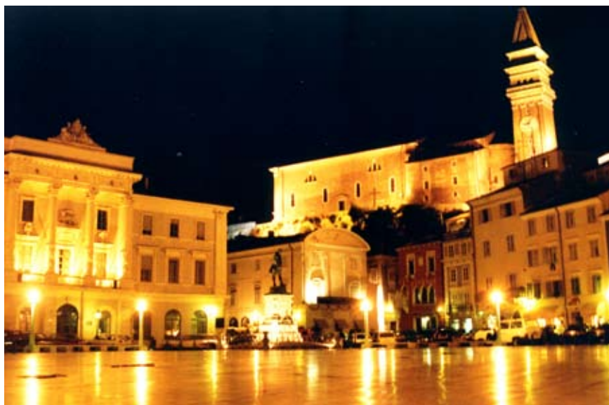
The good square in Piran, Slovenia.

interviewees who brought this up themselves. Many said they felt unsafe near groups of young people, especially ethnic minorities. Interviewees also referred to certain housing areas as 'unsafe', although their only knowledge of these areas came from the media and hearsay. No-one had ever personally visited the housing areas in question. Interviews with users show that assumptions about dangerous people and places have a significant impact on their feeling of safety.