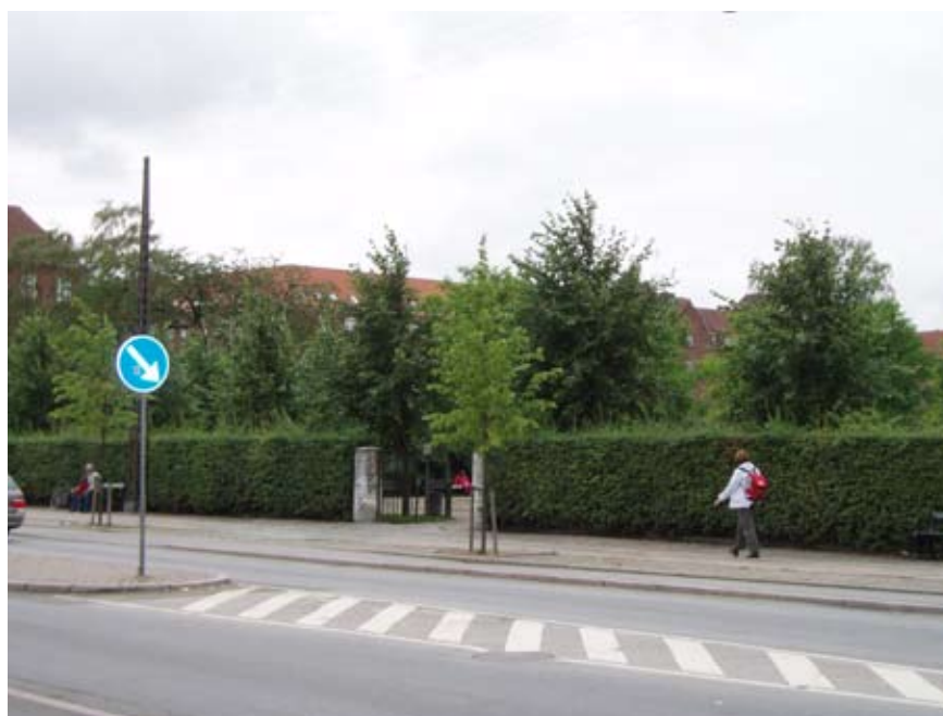
Tall trees, dense bushes and low visibility fuel the fear that someone may be lurking nearby. Shown here: Enghave park in Copenhagen.

and the police add that in some cases there is good reason to be on guard. Physical surroundings clearly influence the sense of safety, and poor maintenance such as litter, damaged benches, broken windows, graffiti and other types of vandalism signal unsafe environments. Deserted areas and narrow empty streets also make many users uneasy.