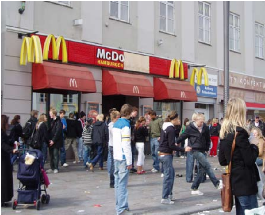
Young people in particular occupy city space. Some come occasionally, while others come often, perhaps daily. The young are mobile and use the city's various spaces for different purposes. Shown here: Nytorv square in Aalborg.

housing and courtyard renovation have brought the housing standard up to the level of newer suburban areas.