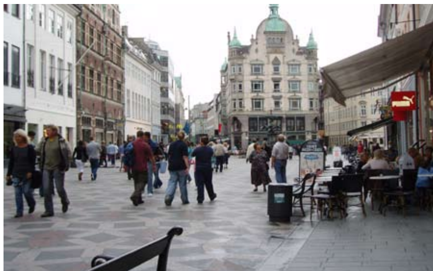
Many people use Strøget, Copenhagen's pedestrian street, and Amagertorv square. The countless shopping streets attract lots of people – including those who commit crimes such as theft and robbery.

Amagertorv in Copenhagen is a meeting place. It is a vibrant square with performing artists and numerous other activities that contribute to city life. Amagertorv boasts cafés, which appeal to the young and make it a hip meeting place. It also has a wealth of shops and is heavily frequented by tourists. Lots of people gather here, attracting others who commit crimes such as theft, robbery and street robbery. Violence occurs later in the evening, especially when people make their way home from the pubs to the town hall square to catch a night bus or to the central railway station to catch a train. This is a problem throughout Strøget, the city's main pedestrian street. It is typically drunks that are involved in violent incidents that mostly take place between people who already know each other or between those who have met in the course of the evening. An opinion expressed by all the people interviewed on Amagertorv was that they felt safe on the square irrespective of time of day. The square