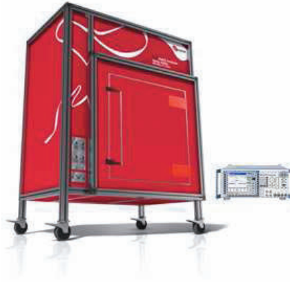
Figure 1: The E300 MIMO Analyzer by EMITE Ing and CMU200 Universal Radio Communication Tester by Rohde & Schwarz.