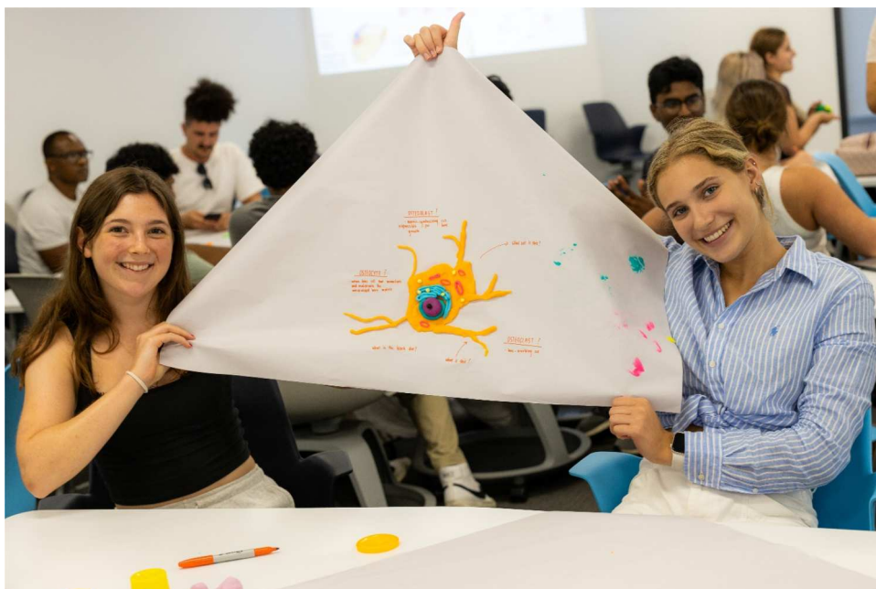
Figure 2. Students in a CRAFTS session using a modelling compound to create a cell found within the human body.

When surveyed, 47% (8/17) of students said that they preferred spending the class time doing hands-on crafting activities in small groups, rather than the option to engage in formal educator-directed teaching. Of the 53% (9/17) who reported they would prefer more time being taught, particular comments (5/9 responders) mentioned the request to spend specific time in revision sessions reviewing challenging concepts.