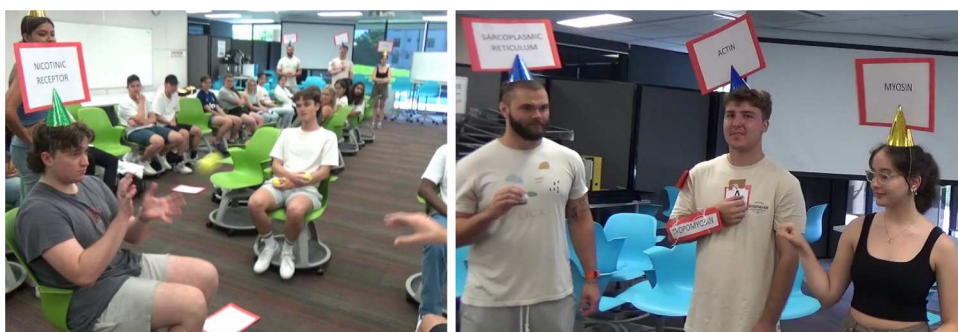
Figure 3. Students in a CRAFTS session taking part in a developed role-play, outlining the main processes in muscle contraction.

Seventy-three percent (73%) of participants (11/15) agreed that creating resources in small groups helped them to learn from other students, as it allows the opportunity to share knowledge