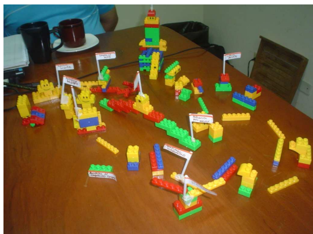
Figure 1. The metaphor of UNAgora

Teachers worked together building diverse components during 20 minutes and later on they explained the diverse elements present in their representation. In order to relate their metaphor of UNAgora, the concept of community of practice and teachers' culture, the researchers introduced the main elements of a Community of practice: domain, community and practice [10] and asked the teachers to identify these concepts in their representation (Figure 1).