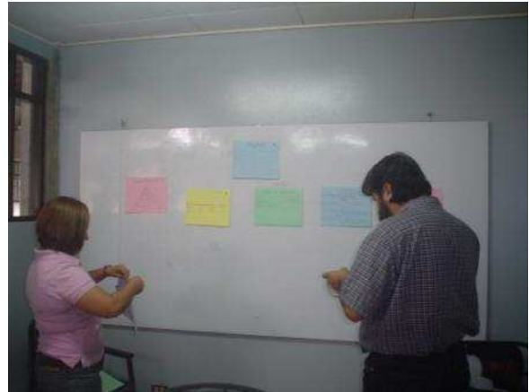
Figure 4. The outcome of design

Teachers worked together during 60 minutes in the activity. This process allowed them negotiate different meanings about issues as the desired profile of the participants, selection process, online and face-to-face communication, strategies to foster participation, institutional support, group work, integration of new-comers, role of the old-comers and distribution of leading and supporting roles. In addition, the workshop opened an important dialogue among teachers and researcher in order to develop a growing strategy for the community.