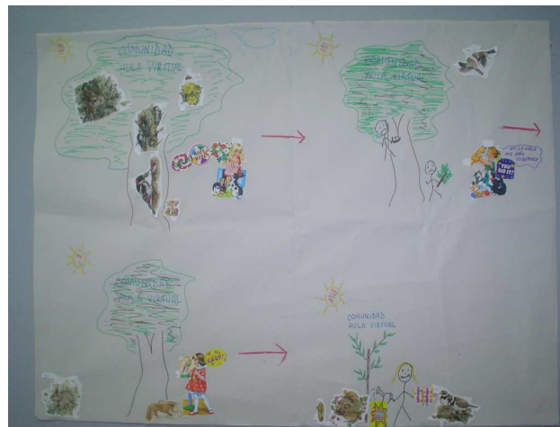
Figure 2. A learning story

Teachers worked individually during 30 minutes in this process and later on they share with the rest of participants their stories. With this activity of story making and story telling, teachers place themselves in a position to make sense of their experience considering cultural, social, technological and personal aspects. We used their stories to talk about changes in identity, adoption of new language, empowerment to transform teaching practice and learning and development of new competences.