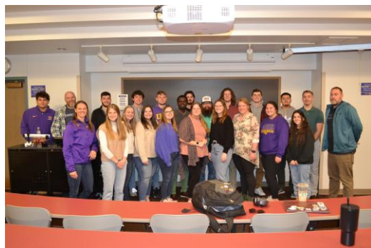
UNI Economics of Sustainability class, Fall 2023

During the Fall 2023, UNI's Economics of Sustainability Class partnered with IWRC's STAR4D program to complete research and analysis and provide program recommendations. Read the full story to learn more.