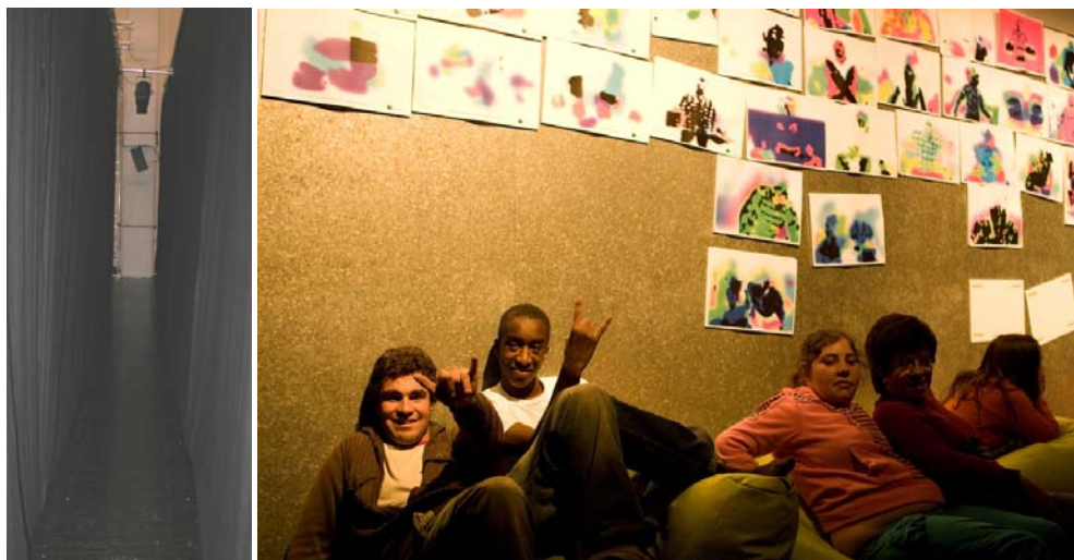
Figures 8 & 9. [Left] ‘area 3’ - the narrow curtained passageway; [Right] ‘area 4’ – chill out + exhibition.

Area 3 (figure 8) was designed as a simple, empty and narrow passageway that was lined with black curtains on either side. It was sized so that each disabled person was encouraged to traverse alone without support (unless required) towards areas 4 and 5. The goal of this transitional area was to evoke a feeling of identity, confidence and self-esteem following experiences gained from the earlier areas.