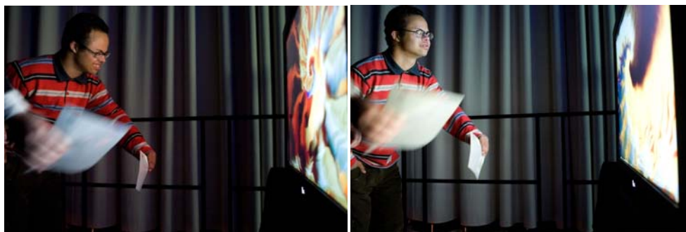
Figures 13 & 14. Using the square reflective artefact in hand to play and perform with sound and images.

A goal of this area targeted the attendee to associate the square reflective artefact movement to the change of sound, vibration and image. This was conceptualised as possibly being a suitable tool for therapists to work with for eye-to-hand coordination, concentration or awareness exercises.