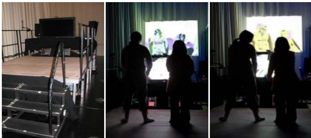
Figures 10, 11, & 12. area 5 – set-up [Left] with printer behind: [Centre & Right] - Two female attendees on the platform exemplified how the control of interactive media through gesture can promote social interaction (Vygotsky 1978); peer learning (e.g. Rogoff 1990), and scaffolding (e.g. Wood et al. 1976).