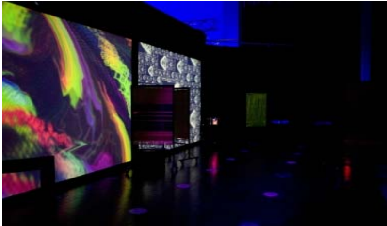
Figure 2. Entrance view of area 1 – approximately 14 meters length x 6 meters wide. Two 4x4 meter back projected screens dominate in the figure by showing examples of the interactive images manipulated via motion. Two of the mobile interactive structures are located in-between and in front of the screens.

modules was mapped to visualisations on a PC. In this way attendees were empowered, to directly affect projected images (figure 2). In this way, the multimedia attributes of the area were dependent on input from the attendee, as otherwise - without movement or utterances there were no sounds, images or vibrations. The mirrored wall on the right of the entrance cannot be seen in figure 2 but this was consciously utilised as an environment design feature.