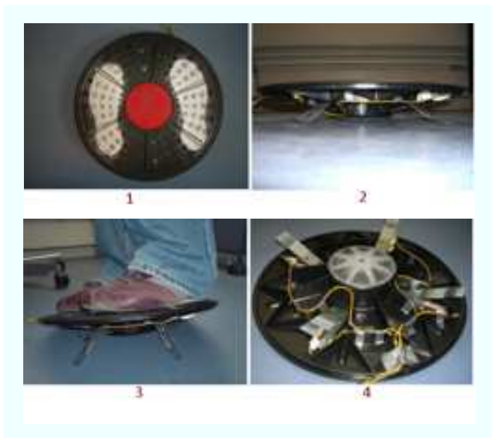
Figure 3: From the Wobble active project. 1 Top view, 2 side view, 3 wobble active in action, 4 the bottom.

A professional physiotherapist was also consulted, who was positive and enthusiastic about the possibility of using the enhanced Wobble board for training.