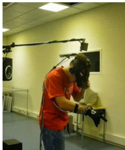
Figure 6: A subject interacting with the VR bowling game.

By building a virtual bowling game, the interdependency