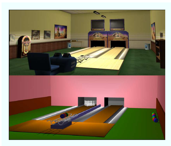
Figure 5: From the VR bowling game. Top: high quality visual display. Bottom: low quality visual display.

The virtual reality bowling game is a project developed during the 7th Semester (first semester of the Master education) in the Fall 2006, under the theme Merging of the senses which addresses the questions just described.