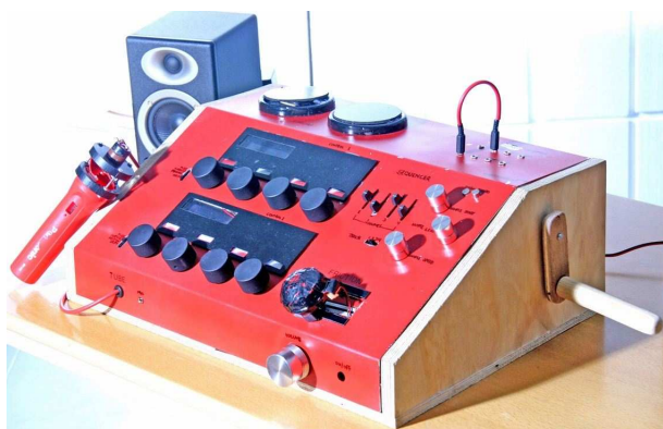
Figure 7: The final look and feel of the PHYSMISM was among other things inspired by old analogue synthesizers.

As can be seen in Figure 7, the PHYSMISM is a novel hardware interface in which several physical models are implemented. Among them, a friction model such as the one found in a bow exciting a string, an aerodynamic model like a person blowing into a flute, a stochastic model similar to the one simulating playing a maracas, and an impact model typical of percussion instruments are implemented.