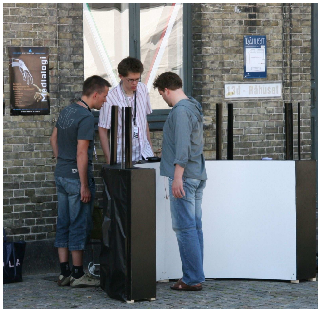
Figure 4: The Soundgrabber was publicly displayed at the Sound Days event in Copenhagen in June 2007.

Moreover, a bucket is placed in the center of the semi-circle. The user interacts with the Soundgrabber using a glove embedded with a bend sensor. By bending the hand inside the bucket, the user is able to grab a sound, listen to it (thanks to the speaker embedded inside the glove) and release it in one of the columns. The Soundgrabber is therefore an interactive installation where users can grab different sounds and place them in different locations.