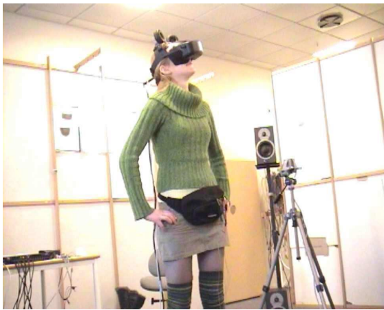
Figure 8: A subject during the experiment in self sound in VR.

140 subjects tried the six different auditory environments. The motion of the subjects was recorded for further analysis. Moreover, after visiting the environment subjects were asked to fill in a presence questionnaire. Such questionnaire was carefully designed by combining several established questionnaires in the field [26, 22, 25]. Quantitative results show that motion significantly increased when a dynamic soundscape and the self-sound of subjects' own footsteps was present in the environment. Moreover, analysis of the presence questionnaire's results showed that subjects reported a strong sense of presence in the dynamic auditory environment. This project won a prize at the Danish SigCHI student price competition for best Master thesis in Denmark 2006. More information related to this project can be found in [17].