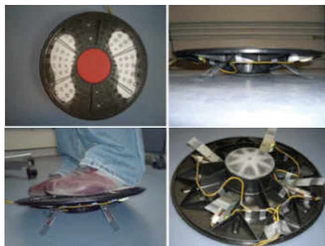
Figure 6. Top left: top view. Top right: side view. Bottom left: WobbleActive in action. Bottom right: the underside.

In theory, WobbleActive could be used as an alternative controller to various computer-interaction functions, similar to a mouse or a gamepad. However, it lacks one important feature to that role, which is an active function equivalent to the mouse click. The hovering method was used in the WobbleActive games to rehabilitate ankles, and it completely solves