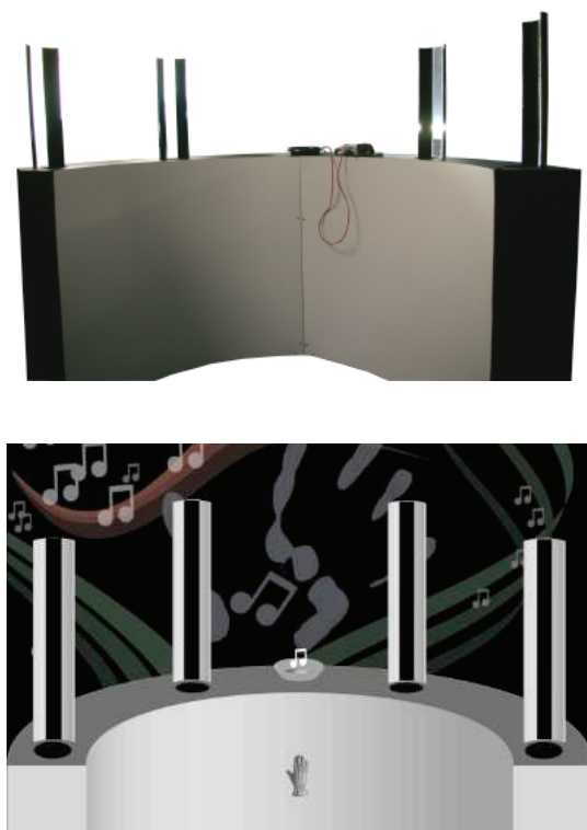
Figure 1. Top: the Soundgrabber, bottom: the graphical user interface.

As part of the test, students wanted to understand for what kind of venues users thought the Soundgrabber was more appropriate. In particular, they wanted to understand in which of the previously visited venues (Experimentarium and Museum of Contemporary art) the installation could be exhibited. Test results did not provide a significant indication in any of the two directions.