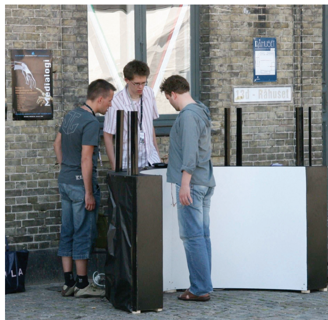
Figure 2. The Soundgrabber was publicly displayed at the Sound Days event in Copenhagen in June 2007.

From August 2007 to December 2007, the Soundgrabber