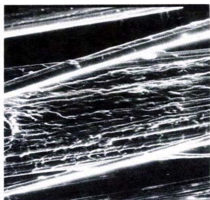
Figure 1 Electron micrograph of hemp fibers

The idea of this unconventional natural cellulosic material use for the batch retention of zinc (II) ions is based on the presence of some potential chelating groups (hydroxyl, carbonyl, methoxy) in the structure of the cellulose and lignine structure (fig.1).