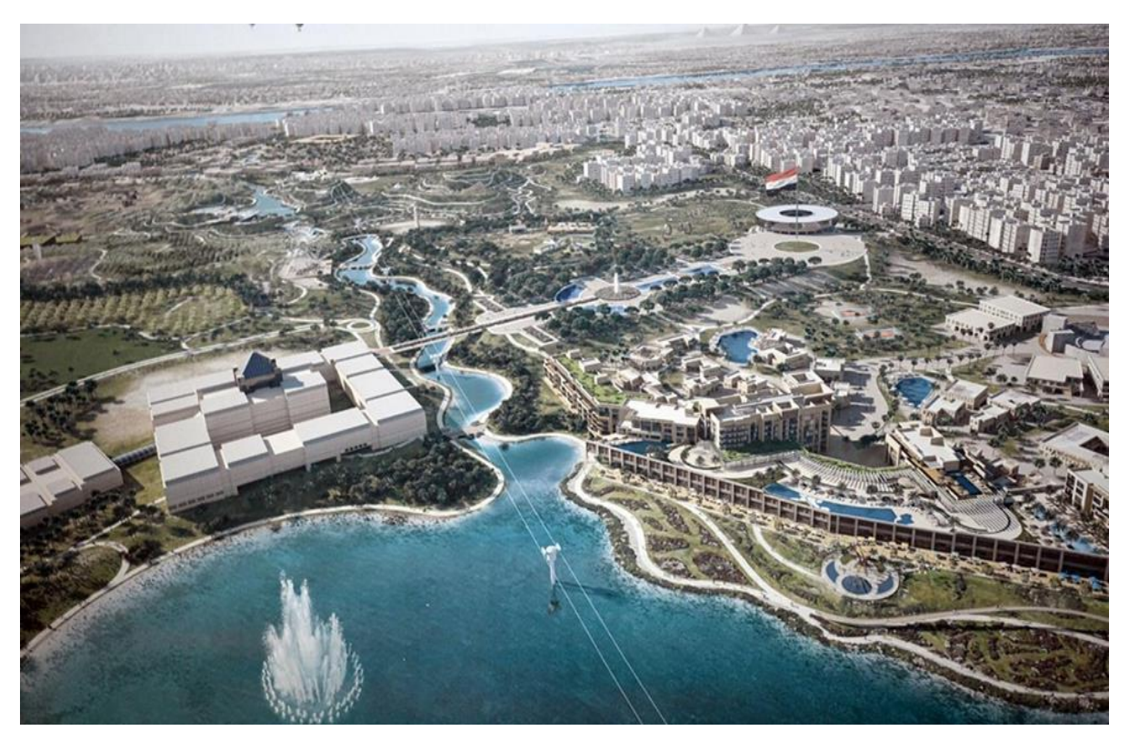
Fig. 3 General Plan of the Al-Fustat Hills Park Project after https://gate.ahram.org.eg/News/2761677.aspx

cultural and recreational activities and reviving the region's Cultural Heritage and traditional industries during the different historical eras. The project included heritage gardens, recreation and adventure areas, cultural-historical areas, business centers, hotels and restaurants, cinemas, and shaping areas. The development's primary goal is to create an outgoing green public park in Cairo related to traditional landmarks, historical landscapes, and cultural attractions (gate.ahram.org.eg/News, 2021).