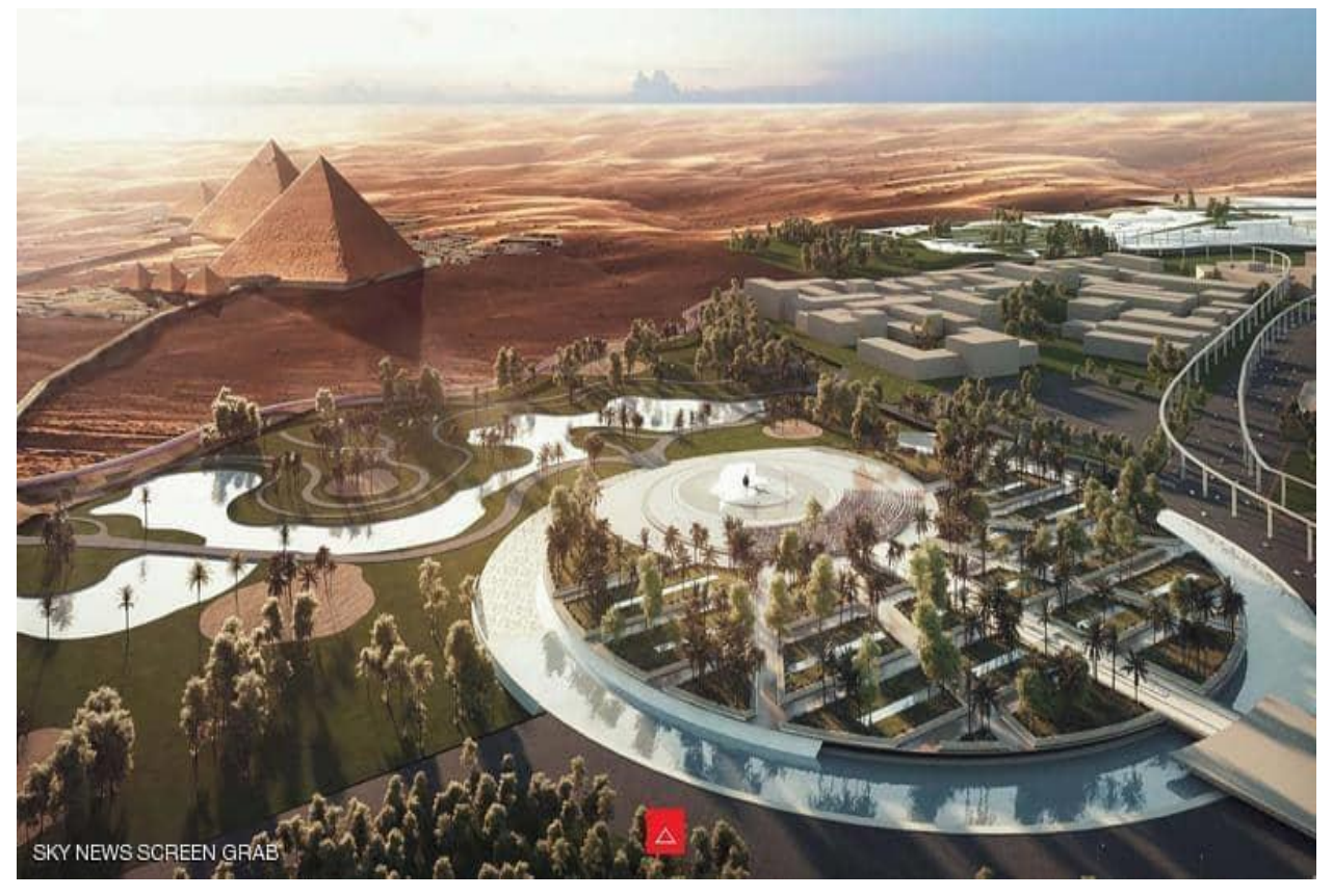
Fig. 6 The General Plan of Tourism Development of Giza Pyramids

all services and facilities. It is expected to open the great project of the monumental area in mid-2021 in parallel with the grand opening of the New Egyptian Museum. The tourism development of the region aims at promoting the site in all communication media in order to place Egypt on the international tourism map and invite visitors from all over the world to see Egypt's great Civilization that will positively affect the tourism industry and all business sectors in Egypt (Hafena A., 2020).