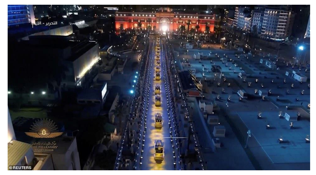
Fig. 4 The royal mummies were transported in a grand parade from the Egyptian Museum in Cairo downtown to Civilization Museum at Fustat after

https://www.dailymail.co.uk/news/article-9433391/Egypt-holds-spectacular-parade-transporting-22-mummies-famous-pharaohs-museum.html