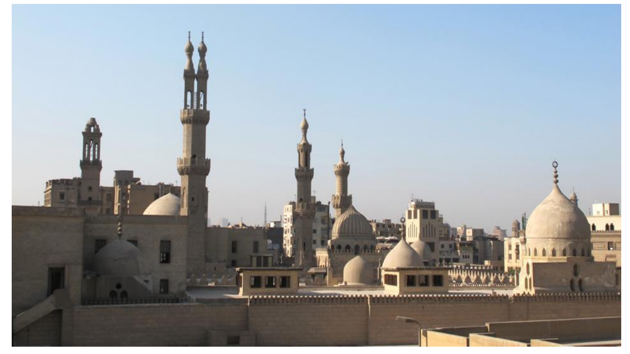
Fig. 1 The Islamic Architecture in Old Historic Cairo after https://whc.UNESCO.org/en/historic-Cairo-project/

The historic city of the old Cairo is considered one of the most cultural heritage cities globally. The city is distinguished by its ancient architectural design and artistic monuments, and a significant project prepared to develop Old Cairo taking into account to maintain its historical landscape and architectural design. The project has been prepared to protect and restore the archaeological