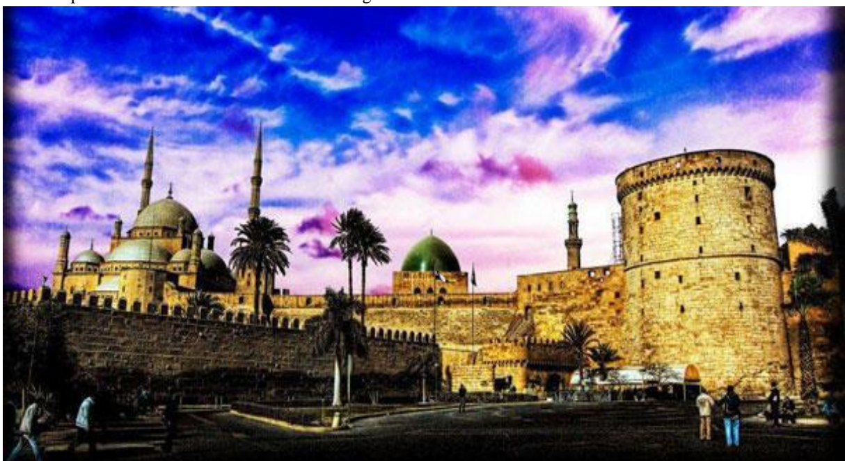
Fig. 2 The old constructions in Historic Cairo after http://www.antiquities.gov.eg/DefaultAr/Projects/Pages/Projectesdetails.aspx

constructions and historical buildings to place them on the sustainable tourism development plan. Additionally, they organized a national program to raise cultural awareness among the citizens and visitors to preserve the region's Cultural Heritage and historical architectural design (Antiquities.gov.eg, ed).