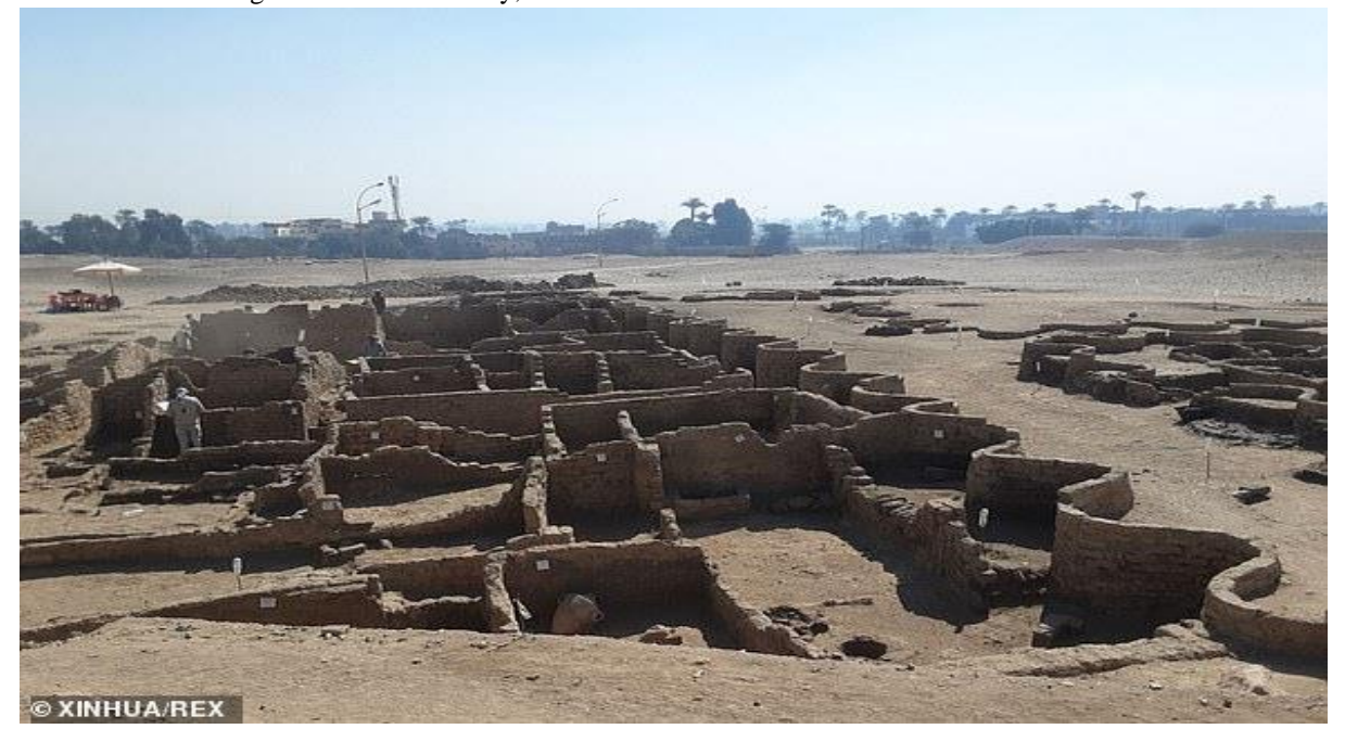
Fig. 12 The lost golden city found at Luxor; it known as Aten, and Amenhotep III built it after https://www.dailymail.co.uk/sciencetech/article-9517389/Egypt

witnessed remarkable progress, especially in light of the recent archaeological discoveries and international events. The lost golden city known as Aten was built by Amenhotep III, who ruled the region in 1390BC, and Tutankhamun came later to govern the site. The city was discovered in Luxor near the temple of Amenhotep III; its design with its neighborhoods, streets, workshops, jewelry, pottery, blocks bearing the name of Amenhotep III and cemetery of animals and humans (Morrison R., 2021).