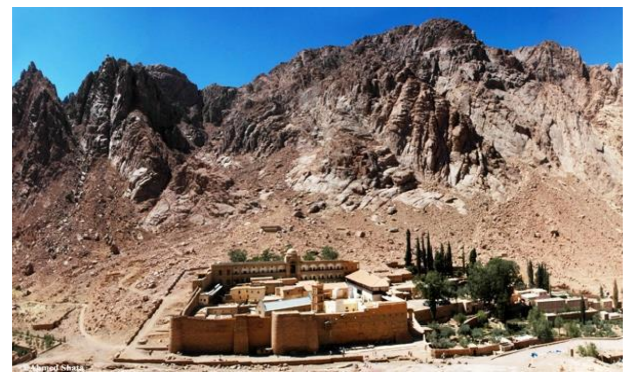
Fig. 10 Saint Catherine Monastery in the Central Sinai

Sinai is known as the land of turquoise that has unique attractions. It considers the primary resource of sustainable tourism development. Sanai has a strategic location where the connection bridge between Egypt and the Eastern World. However, Egypt is located in the North of Africa, Sinai is situated in Asia. Sinai is looking over the Mediterranean Sea on the North, Agaba Gulf on the East, and Suez Gulf and Suez Canal on the West. Sinai is divided into three parts, the plain desert area in the North, Sinai's plateau and hills in the middle, and the high mountains in the South. However, Sinai has various attractions and many different materials that will benefit the country's development. The development plans are currently in progress that aim to connect the western part of Sinai with the big cities of the Suez Canal through the tunnels, bridges, railways, and setting up many different cities in Sinai to achieve sustainable tourism development (Mohamed A. 2021).