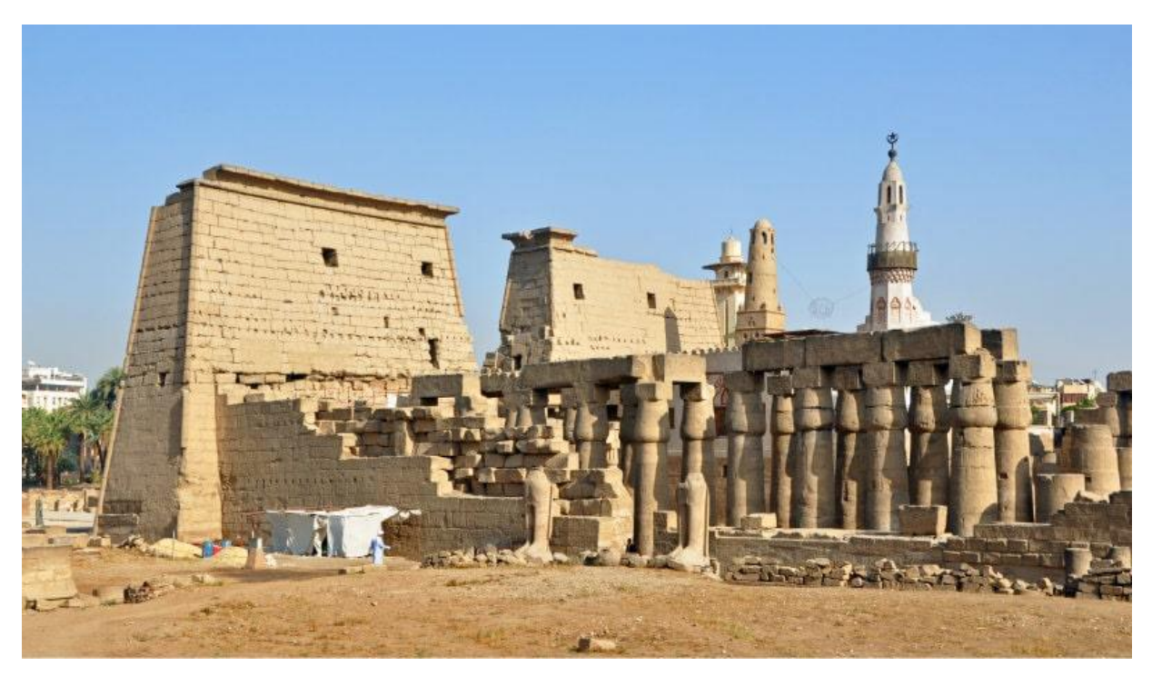
Fig. 8 Luxor temple