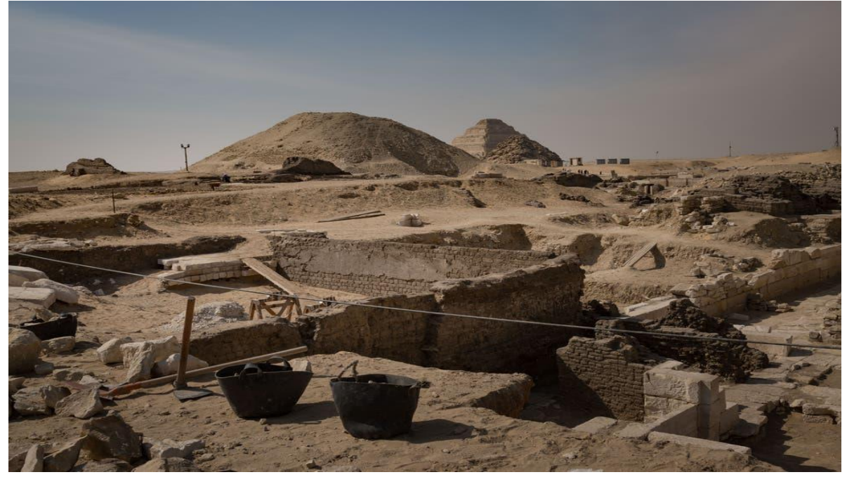
Fig. 13 Archaeologist Zahi Hawass's dig site at Saqqara where the discovery of a queen has reshaped the understanding of ancient Egyptians

New discoveries at Saqqara will rewrite Egypt's ancient history. According to the inscriptions found at the site, the location included an ancient temple belonging to queen Neit, the wife of king Teti; the 1<sup>st</sup> king of the 6<sup>th</sup> dynasty. Various painted coffins and mummies were discovered wrapped in linen, two limestone coffins. It was believed King Teti had two wives called Iput and Khuit, and later Neit was the 3<sup>rd</sup> wife that she was previously known, and her temple has been discovered in the site. Saggara is an important archaeological site in Egypt. The place was a part of the cemetery of the ancient capital Memphis classified in the World Heritage List (UNESCO). In Saqqara, the oldest pyramid in Egypt's ancient history, the Step Pyramid of Djoser was constructed by minister Imhotep in the 27th century B.C. It was discovered in the site about 100 decorated wooden coffins, various artifacts, valuable pieces, amulets, face masks, and funeral statues (Mahfouz H., 2021).