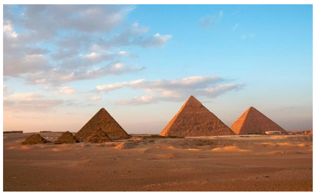
Fig.5 The Great Pyramid of Giza as a part of Memphis and its Necropolis http://www.antiquities.gov.eg/DefaultAr/WorldHeritageSite/Pages/default.aspx

until the end of the Greaco-Roman period. The site included many archaeological sites such as; Giza, Saqqara, Abusir, Mit Rahina, and Dahsur. The region consists of the most important monuments globally: the great pyramids at Giza, the step pyramid at Saqqara, the significant pyramids at Abu Sir and Dahshur. A great project has been done to preserve Cultural Heritage and archaeological sites; strategic planning for developing the area and placing it on the world tourism map (UNESCO Center, 2021).