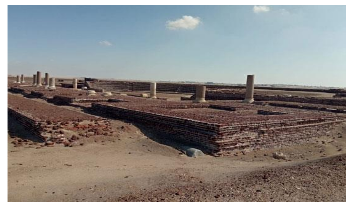
Fig.11 Red-Bricks Buildings Located on the Road of the Holly Family at North Sinai after https://www.youm7.com/amp/