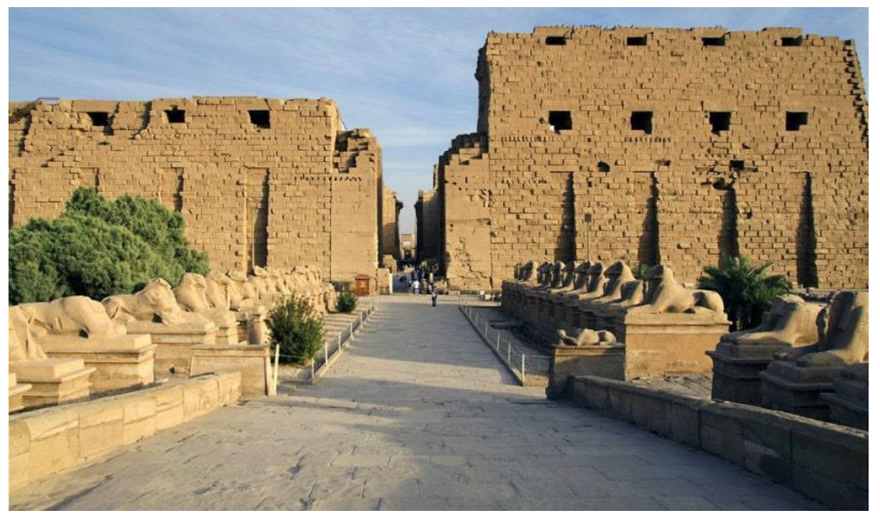
Fig. 7 Karnak temple

Additionally, Luxor temple is located near the Karnak temple's eastern side of the river Nile. The temple fronted by great pylons built by king Ramses II and two statues of King Ramses II. The temple of Hatshepsut considers one of the largest mortuary temples located on the west bank of the river Nile. It is an important temple at Luxor which tourists come to visit from all over the world (Hendawy A., ed).