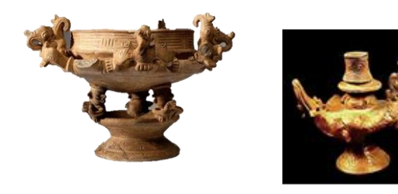
Figs.3, 4, 5, 6, 7: ceramic objects anthropomorphic representations

Figs.1 and 2: caryatid vessels - ceramic objects