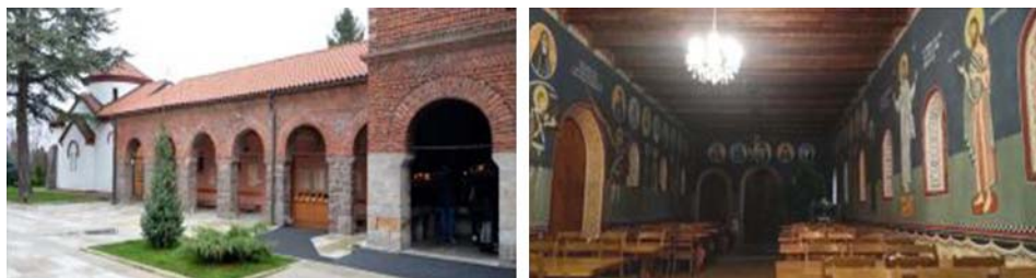
Figure 1: The Dining Room of the Žiča Monastery property: left - appearance of the church of St. Sava and the Dining Room from monastery yard, right - the interior of the Dining Room

The Dining Room is a ground floor building, located in the southwestern part in relation to the outer narthex of the Church of Holy Dormition. In the extension of the Dining Room, on the east side, there is a closed vestibule (porch), to which the Church of St. Sava continues (Figure 1). The Dining Room was built in 1935. This facility was meant to be a guest house, i.e. a dining room where guests and believers who visit the monastery can relax and have some juice, coffee, tea or liqueur made by the nuns themselves. This facility is used during the morning and afternoon from 9 am to 5 pm, and is heated when it is necessary by underfloor heating via heat pumps. This large building, the Dining Room, consists of a reception area, a kitchenette, intended only for making tea, coffee, serving and washing dishes. It is not meant for preparing, cooking or serving food. There is also one office and a toilet area.