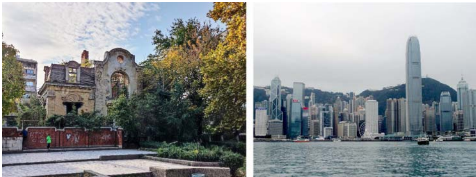
Figure 1: Vidin, Bulgaria: the effects of urban shrinkage are visible in urban space (Author: D. Siljanović Kozoderović); Figure 2: Hong Kong is one of the main global cities (Author: B. Antonić)

However, the process of urban shrinkage can not be scrutinised through the dichotomy 'weak industrial performance vs. population decline'. There many involved factors which even can be easily determined if they are (just) causes or consequences (Pallagst et al, 2014). For instance, the first wave of population loss in the initial phase of the shrinkage of a certain city relates to 'brain drain', which limits the prospects of urban economy in the next phases. Moreover, there are many other factors critical for urban shrinkage, such as suburbanisation (Guimarães et al, 2015), weak urban governance (Rink et al, 2009), bad transport connections (Hollande, 2010) or borderland position (Antonić et al, 2020). All these factors make urban shrinkage more visible in urban space (Fig. 1), which is also among the characteristics of the entire phenomenon. Finally, some of them refer to the issues directly related to globalisation, such as an (underperformed) urban transition in the mobility of people, goods and capital (Oswalt & Rieniets, 2006).