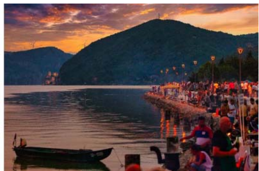
Figure 3: Ruma, Serbia: the former industrial character of many cities slows its further urban transformation (Author: B. Antonić); Figure 4: Golubac in Eastern Serbia is an example of a town which has significantly slowed its shrinkage due to fast tourism development last years, but limited municipal capacities (financial, organisational, professional) are still preventing broad socio-economic benefits for local community (Author: D. Miletić / source: TO Golubac)

This opposite case to global cities does not have a specific, well-known name. They are sometimes named as NON-GLOBAL CITIES (Ren, 2011), but this term is still not internationally widespread. There