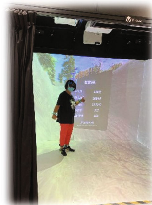
Picture C. Sensors attached to headset and limbs