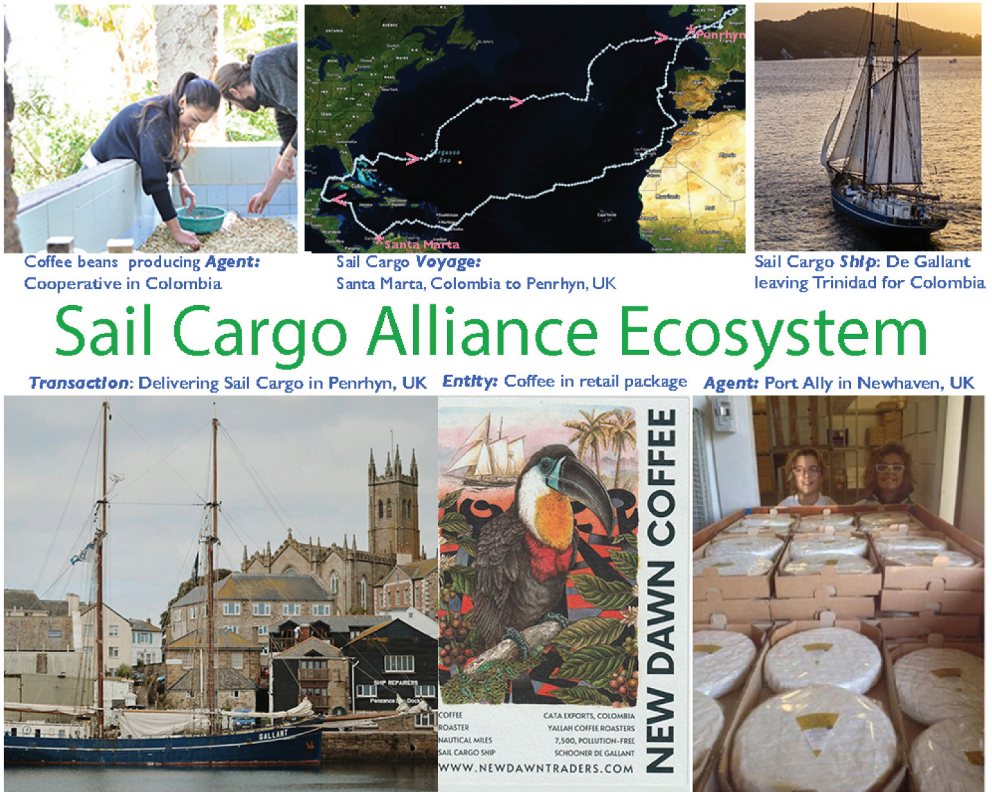
Figure 1. Aspects of the Sail Cargo Alliance Ecosystem.

UK) 1 to operate the Sail Cargo division as the Port Ally in their area and, as such, to sell sail traded goods. Locally through (i) arranging quay-side marketing events to celebrate the arrival of a schooner carrying Sail Cargo products and (ii) arranging immediate delivery from the ship to local customers by carbon-free transport (electric vehicles, bicycles, rowing gigs, etc.), together with continuing sales at local food markets.