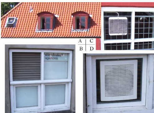
Figure 9 some ventilation modes in Aalborg

Ventilation is an important function of windows. When the temperature, humidity and cleanness of outdoor air are beneficial for the indoor climate, natural ventilation is the best way to be used (see figure 9-A). Whereas, when the enthalpy difference between outdoor and indoor air is not fit for natural ventilation, it's an effective measure to tighten windows and reduce the air infiltration, thus to reduce the energy consumption by windows [6] . In this situation, for a basic provision of fresh air, the mechanical ventilator was developed, see figure 9-B, C, D. It both reduced the impact of disorganized natural ventilation on the indoor climate and satisfied the hygiene requirement of IAQ. The EU new requirement of energy efficient in buildings demands that the air infiltration must not exceed 1.0 L/s.m 2 at 50 Pa pressure differences, which corresponds to an average air change of 0.1 h -1 .