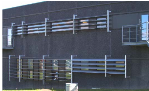
Figure 6 external shade devices in Aalborg

Compared with the flexible shade devices, Chongqing uses more fixed ones contrarily. The shading may be concreted into the building itself, or may be installed after the running of buildings, see figure 7 and figure 8 respectively.