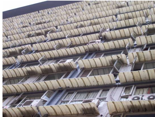
Figure 10 typical ventilation modes in Chongqing

Almost all the windows in Chongqing adopt natural ventilation, see figure 10. Chongqing has a high outdoor temperature in summer (37–39°C), low and moist in winter (2°C and 82% relative humidity) [8] . Natural ventilation may increase the air-conditioning energy much higher, which is opposite for the aim of energy efficiency in windows.