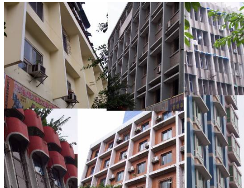
Figure 7 concreted external shade devices in Chongqing

The fixed shading can reduce the direct irradiation, but it still reduces the day lighting for its lack of adjusting capability. Especially, the concreted shading enlarges the external area of the building envelope, thus will intensify the heat transfer between the outside and the indoor climate. In Chongqing, it's will get a reversed result of energy efficiency for most of time. From the view of the author, flexible shading has an advantage use than fixed one in Chongqing.