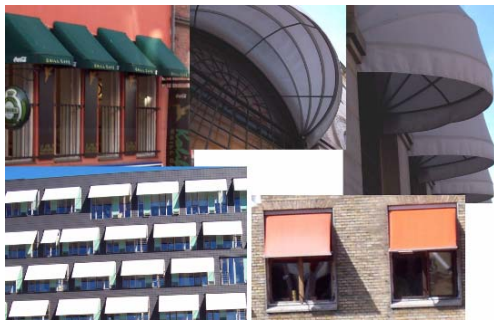
Figure 4 some external shade devices in Aalborg

Buildings in Aalborg often have flexible external shade devices, see in figure 4, which can avoid direct irradiation and can use day lighting to the most degree. The shade devices can be adjusted to gain energy efficiency in windows. Such principal was used in the internal shade devices too, see figure 5. Some buildings, for more advanced, integrated the adjusting of shade device into the IT system of the buildings, thus made the shade devices adjusted automatically to the outdoor and indoor climate, see figure 6.