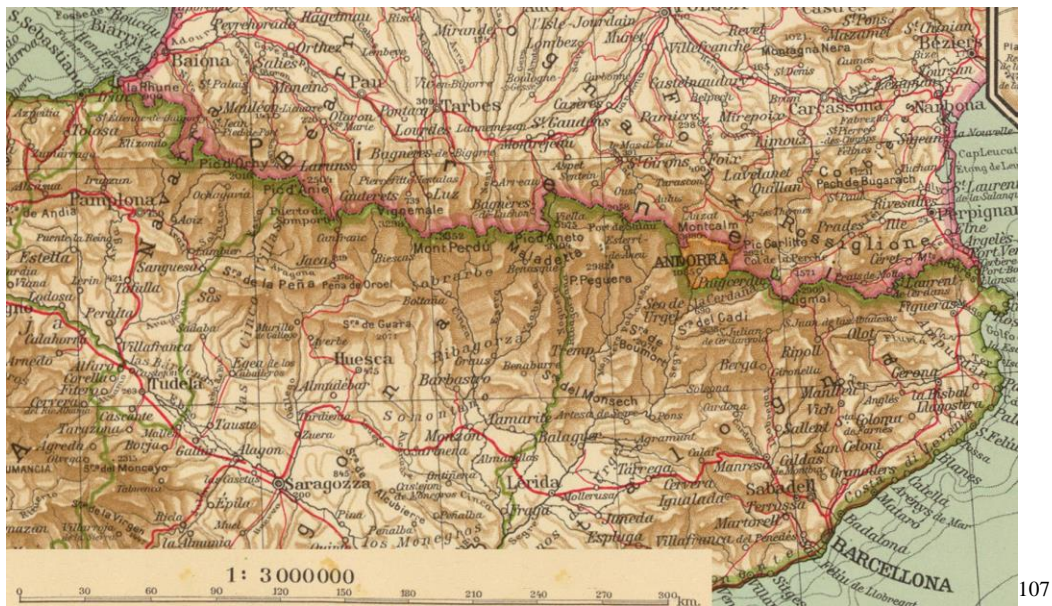
Above: Northern border with Spain.

and ports. 106 The map below shows the border between Spain and France as well as the long road around the Pyrenees. The second map shows the area of and around Irún, Spain.