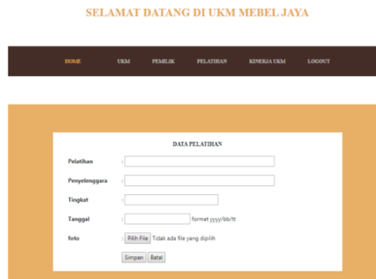
Figure 5 : Training Data Page

Users or owners of SMI'S can also enter the training data that has been followed so that the local government can see the training data and can organize the training that has never been attended or that supports the performance of the SMI'S So that it can improve the productivity of SMI'Sas shown in Figure 5.