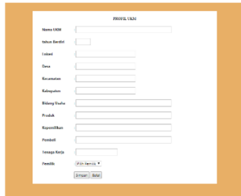
Figure 4 : Profil SMI'S