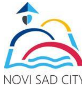
Tourist organization city of Novi Sad