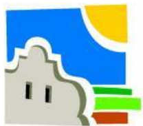
Tourist organization of Vojvodina