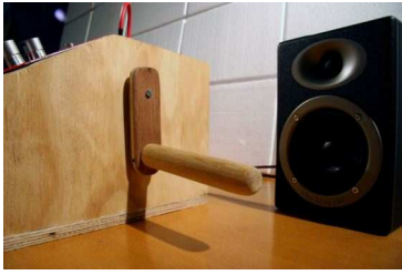
Figure 5: The crank implemented for exciting the stochastic model is attached to a dynamo.