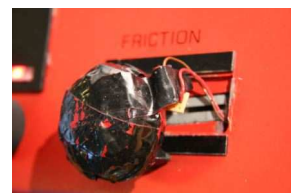
Figure 4: The rubbing excitation device is implemented with a two dimensional slider with a pressure sensitive ball on top.

In order to control the friction model an excitation device was created using two slider potentiometers and a pressure sensor, as shown in Figure 4. The device was created in order to give the user the same input capabilities as if he was rubbing his hand over a surface. The left-right motion was detected by the first slider, which was placed horizontally on the device. The pressure sensor located on top of the device detected the pressure applied to the surface. Finally, in order to simulate the capability of rubbing on different areas of the surface, the second slider was placed vertically on the device. The three sensors were used to control the velocity, bow position and force inputs of the friction model respectively.