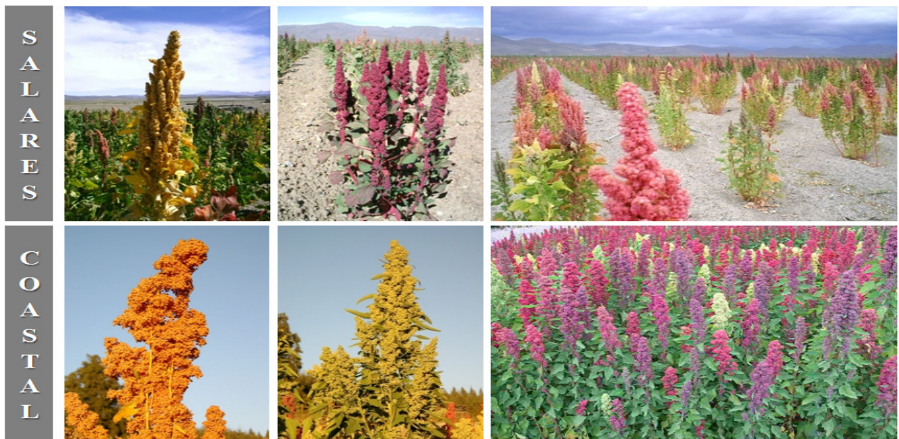
Fig. 2. Morphological variation of quinoa ecotypes cultivated in Chile. Salares (north) and Coastal (centre and south) ecotypes

According to Looser (1943), cultivation of quinoa almost disappeared in Chile during the first part of the 20th century. It survived thanks to women and indigenous small-scale growers who cultivated it in the central zone at the north-eastern frontier with Peru and Bolivia (Lanino, 1976), and near sea level in Concepción and in Mapuche reserves, where it was also called quinhua or kinwua (Junge, 1978). The expansion routes of quinoa were identified by Fuentes et al. (2012), with the support of molecular markers. The expansion pattern implies a microevolutionary process, but also different ecological and agricultural types of exploitation