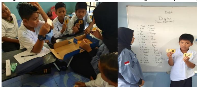
Picture 1. Learning activities using flashcard Sanggar Bimbingan in Malaysia

Here is a picture of the teaching and learning activity using flash cards: