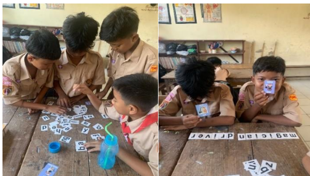
Picture 1. Learning activities using flash Public Elementary School in Waru