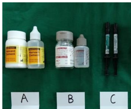
Fig 1: Group A,B,C luting cements.

the specimen between the tension and compression surfaces. The obtained results were subjected to the statistical analysis.