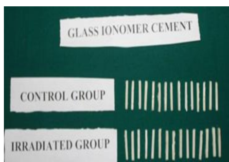
Fig 3: Group B Rectangular specimens of Glass Ionomer Cement