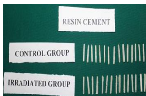
Fig 4: Group C – Rectangular specimens of Resin luting cement