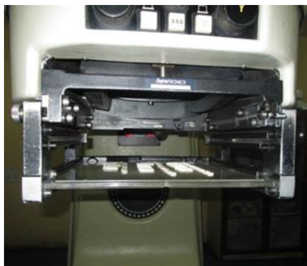
Fig 5: 60 Gy by a Cobalt-60 external beam machine (Theratron – E1)