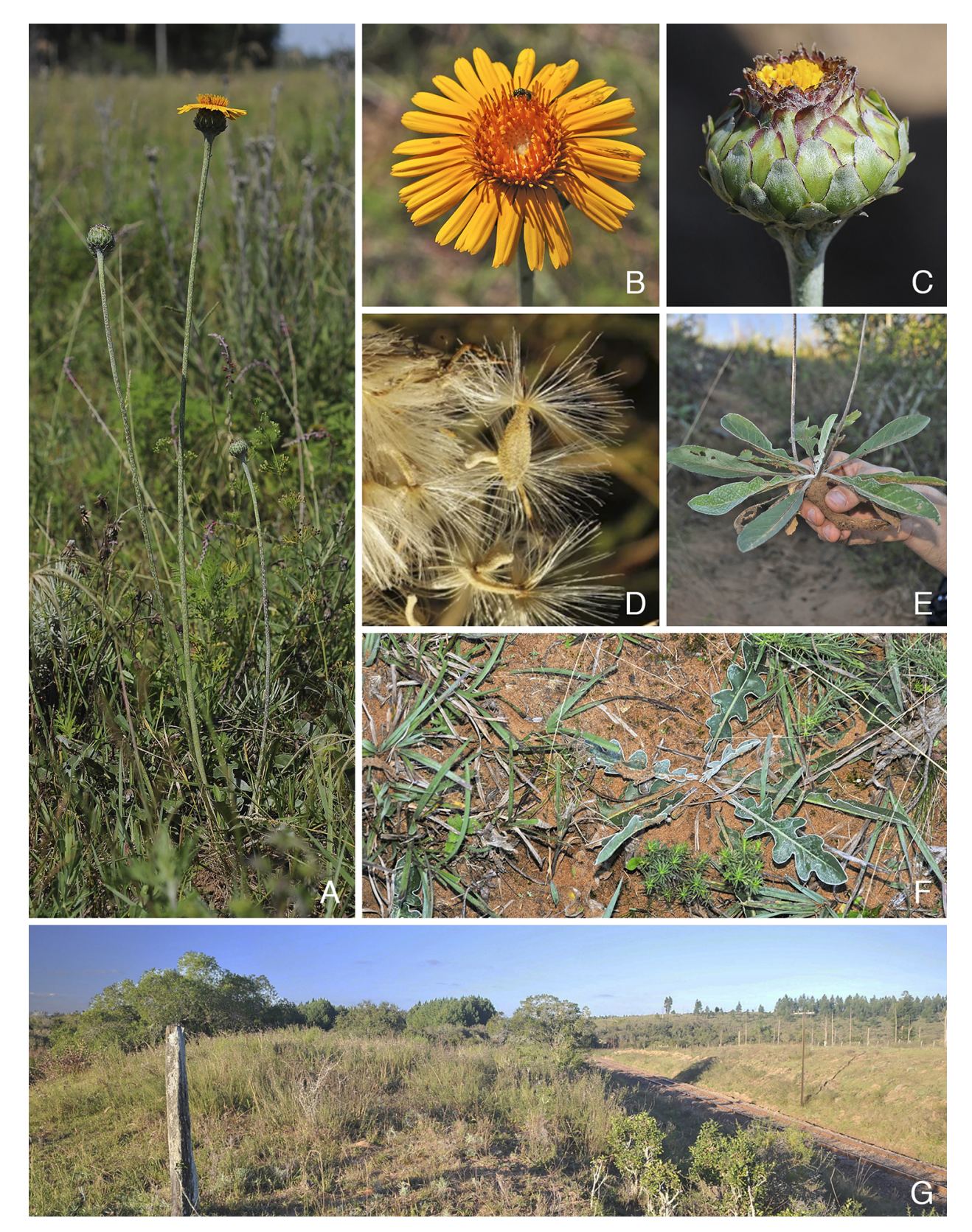
Figure 1. A-G. Trichocline maxima . A. General view of the species habit; B. Capitulum; C. Involucre; D. Detail of achene and pappus; E. Detail of rosette leaves, scapes and xylopodium; F. Detail of the rosette and lobate leaves; G. Habitat.