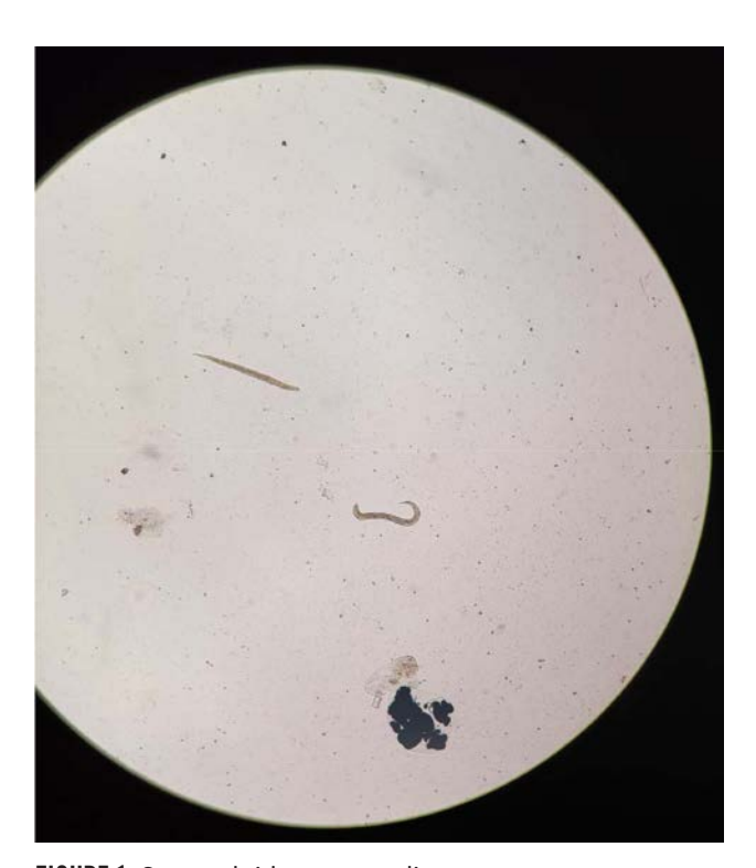
FIGURE 1. Strongyloides stercoralis

The patient had psycho-emotional instability with easy crying throughout the hospitalization and he requested the discharge several times, so on 27.04 he is discharged by his request against medical advise. On discharge day he is time-spatial oriented and to one's own person, no signs of meningeal irritation. He receives treatment indications with Albendazole 400 mg po b.i.d for 7 days, until medical reevaluation.