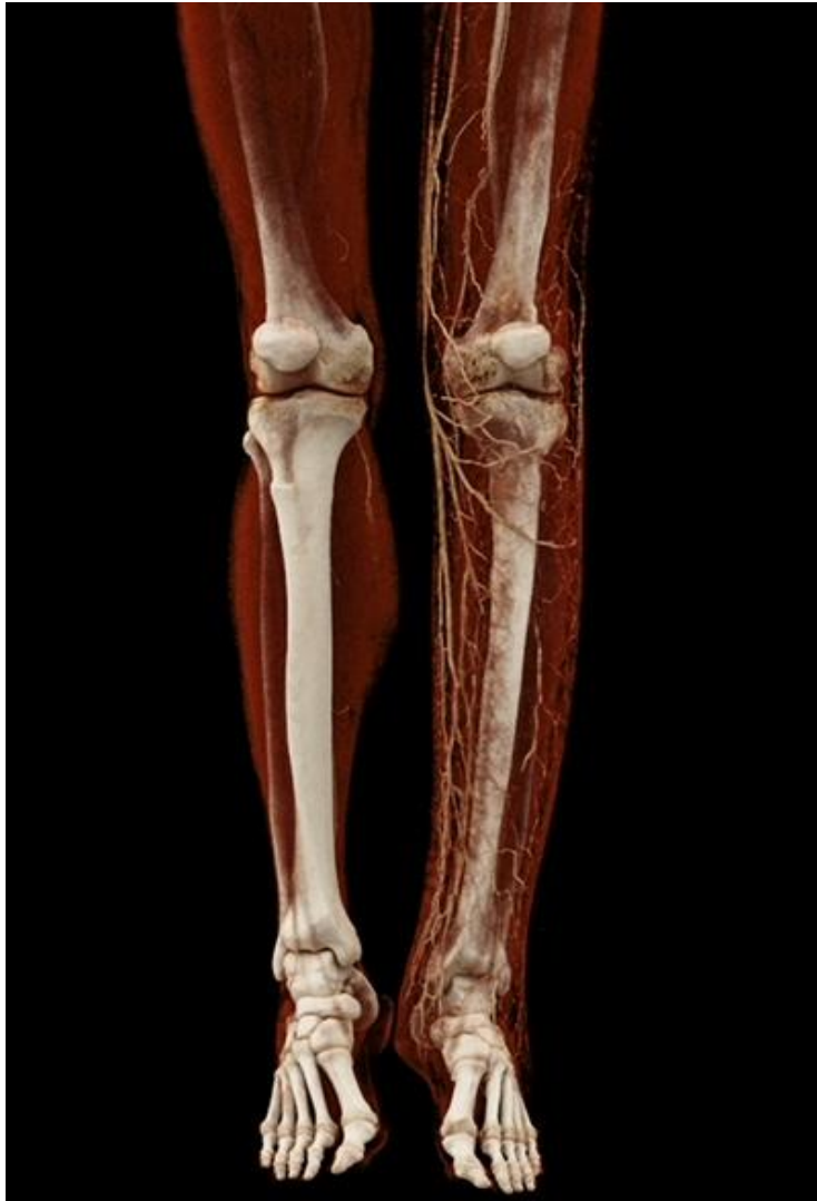
Figure 1. CT VR, numerous spreading vascular structures in the subcutaneous tissue of the left thigh and lower leg. Intensified vascular network in the midshaft of the left femur, tibia, and fibula. Generalized atrophy in the muscle structures of the left thigh and lower leg.