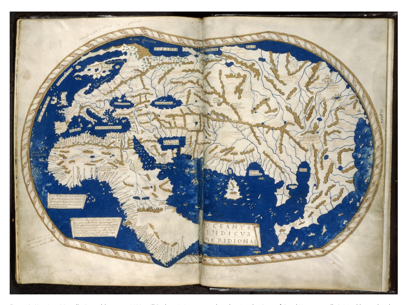
Figure 2: Henricus Martellus's world map, c. 1490, still Ptolemaic in structure but showing the Cape of Good Hope as well. Original located at the British Library (shelfmark: Add MS 15760).

Another famous work by Martellus, a large world map produced in 1490 and now preserved at Yale, represents Japan off the coast of Asia, and proposes a fairly narrow estimate of the distance between the island and the west coast of Europe: virtually, only 90 degrees of longitude. Increased global travel had resulted in clear cosmographic changes, even as traditional assumptions about the arrangement of land and sea continued to be utilized.