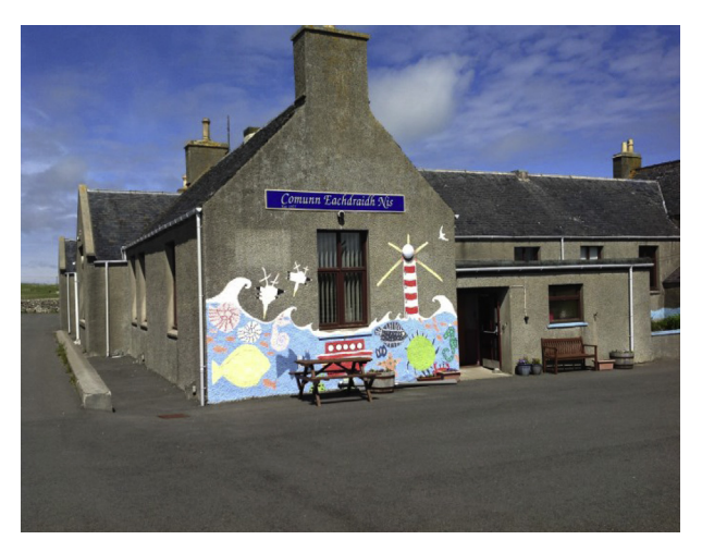
Fig. 1. CE Nis (Ness), Lewis.

Portsoy is a small fishing town that has a harbour that dates to the late seventeenth century. The Portsoy Salmon Bothy developed from the success of the community organised Scottish Traditional Boat Festival (see Fig. 3), which began in 1993 to celebrate the harbour's tercentenary. The hosting of the festival, which originally had its focus upon small Scottish traditional sailing boats, was initially highly successful, and so became a yearly event that grew in popularity due to community and volunteer efforts. The festival developed to integrate other cultural aspects into its remit as it grew, including music, food and craft. This success led to the development of the Salmon Bothy. Once an ice house (Fig. 4) for the Salmon fishing industry (that ended in 1993), it was refurbished and re-opened in 2011 due to volunteers securing funding for its restoration. The Bothy is a museum, community space and office for