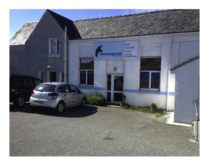
Fig. 2. Ravenspoint, Lewis.