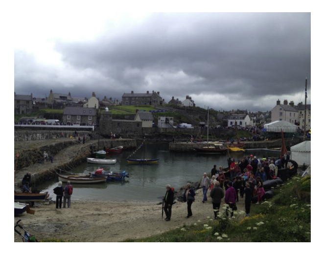
Fig. 3. Traditional Boat Festival, Portsoy.