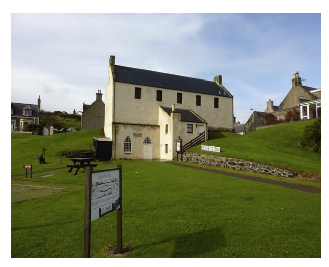
Fig. 4. Portsoy Salmon Bothy.

the Traditional Boat Festival and continues to thrive due to the role volunteers' play in sustaining it as a community enterprise: