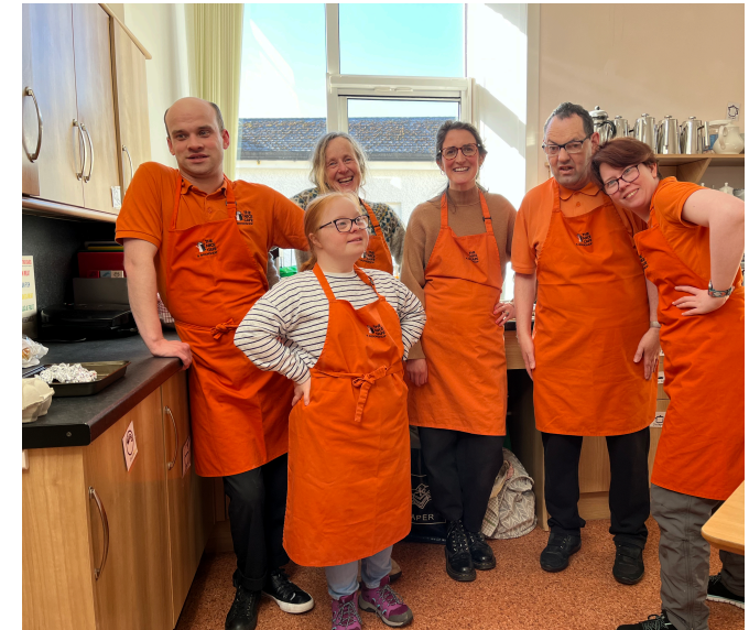
Kyleakin Connections cafe

Connection is “feeling a part of something larger than yourself, feeling close to another person or group, feeling welcomed, and understood.” 1 Connection helps people feel that they “belong.” We believe that doing community-based research can help people with learning disabilities connect, belong and improve health and wellbeing.