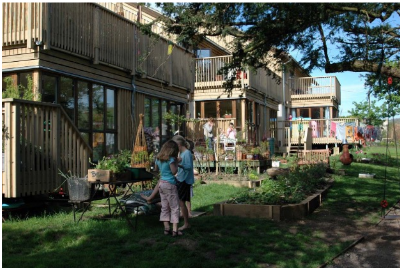
Springhill Co-housing, Stroud, Gloucestershire by Architype

In Germany, the State, in collaboration with local communities, decide where development should occur and puts in place the necessary infrastructure. The Scottish Government should consider – as highlighted by the Scottish Land Commission – the lessons to be learnt of such a model and the benefits of their application in Scotland.