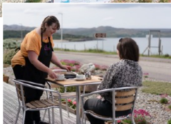
The GALE Centre community hub, Achtercairn, Gairloch, Highland Small Communities Housing Trust