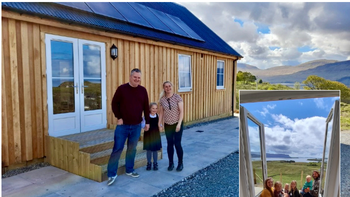
Ulva Ferry affordable rental housing, Mull and Iona Community Trust, by Thorne Wyness Architects

Two new high-quality, three-bedroom homes were built next to Ulva Primary School, and in 2017 these were offered for long-term let to local families on secure tenancies. They provided a home to two families and contributed six children to the local primary school role.