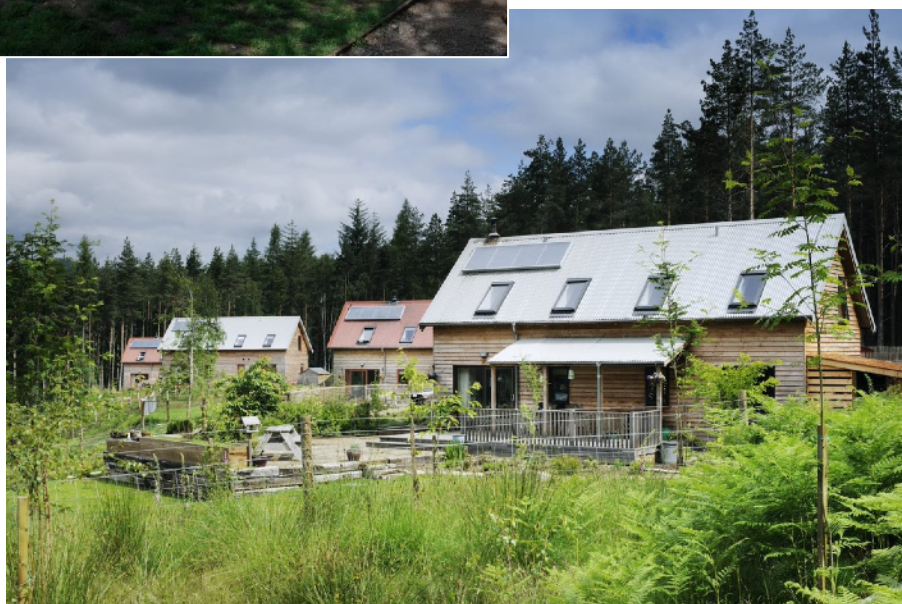
Ardgeal, Kinraig by David Somerville Architects: affordable homes built with the Highland Small Communities housing trust