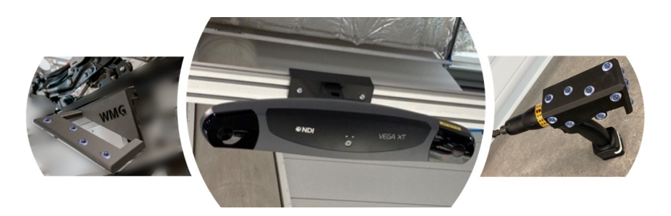
Figure 3 : Pallet-mounted marker (left), NDI Polaris Vega® XT optical tracker (middle), tool-mounted passive markers (right).

To implement hands-free AR-enabled HMI for the use case, Microsoft HoloLens 2 is used. The sensors (e.g., IR cameras, IMU, depth) equipped in the device provide capabilities to deploy high interactive and hands-free features (e.g., gesture tracking and voice control) in the AR application. A Universal Windows Platform (UWP) application is developed with Mixed Reality Toolkit (MRTK) from Microsoft on the Unity 3D platform while Vuforia SDK from PTC enables marker detection and tracking. CAD file of the product (e.g., obj, fbx, stl) is used as a marker for the virtual environment so that no extra markers are required on the working station. The NDI coordinate system with respect to the global marker is transformed to the coordinate system with reference to the product marker and the AR content is displayed accordingly.