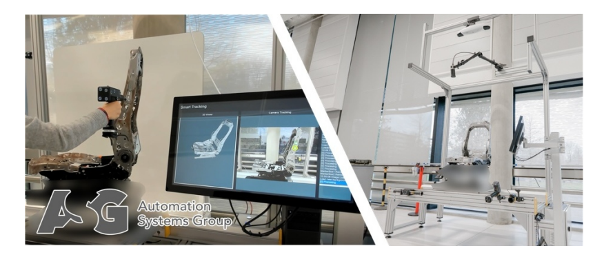
Figure 4: Screen-based work instructions with 3D model view (left) and overview of the DAMPO station set-up (right).