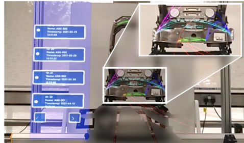
Figure 5 : Left: HoloLens view of the second assembly process step, with the target tooltip position displayed as a magenta disc in the AR layer. Right: AR HoloLens view of tool paths for 6 cycles (historical data display).

The HoloLens, in the meantime, subscribes to the MQTT broker to receive real-time tool pose and validation results generated by the data processing software and update the guidance accordingly (i.e., changing the colour of the working instructions). Figure 8 shows the scenario that the first screwing