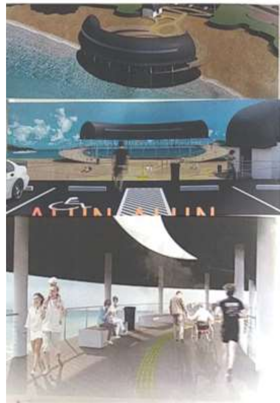
Figure 4. Design work “Senggigi Square”