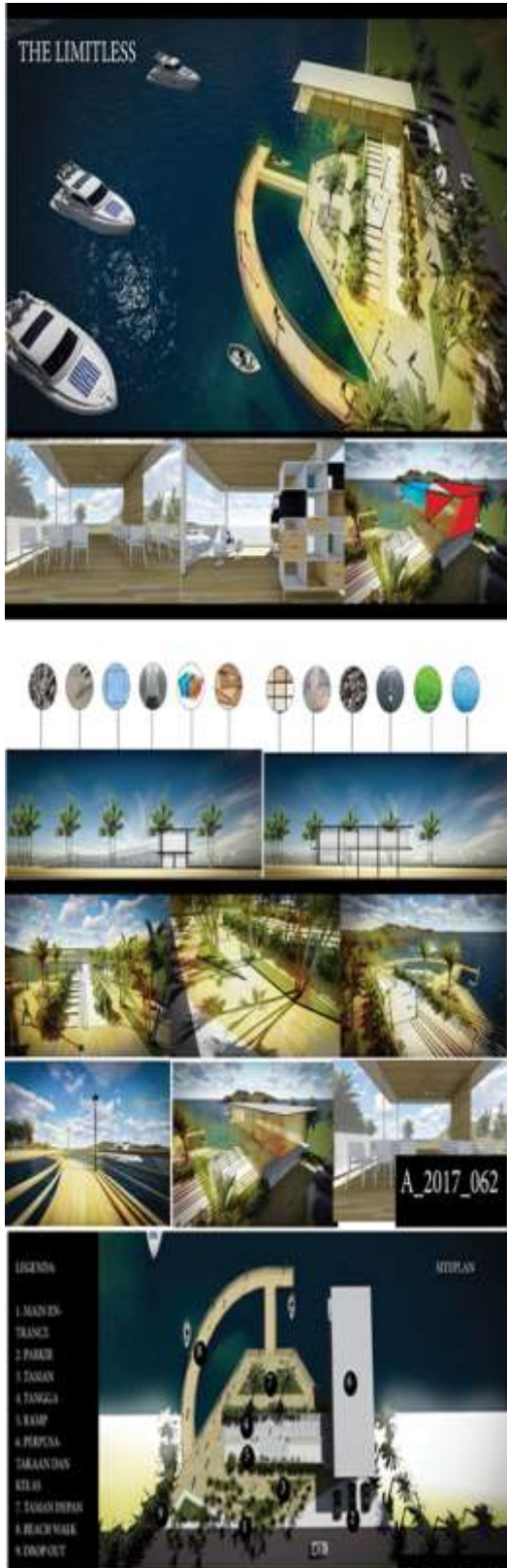
Figure 2. Design work “The Limitless”