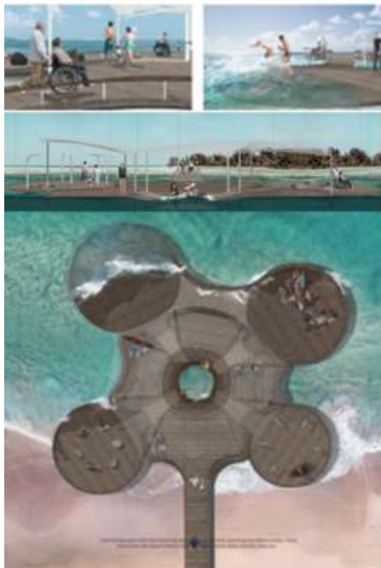
Figure 6. Design work “Build Opportunity, Build Beach”

Description of work design of beach space above mentioned below discuss each title of design theme. Design of beach space was making using international standard reference (size and installation) which is summary in Leslie C. Young's book Curbless Shower: An Installation Guide [8].