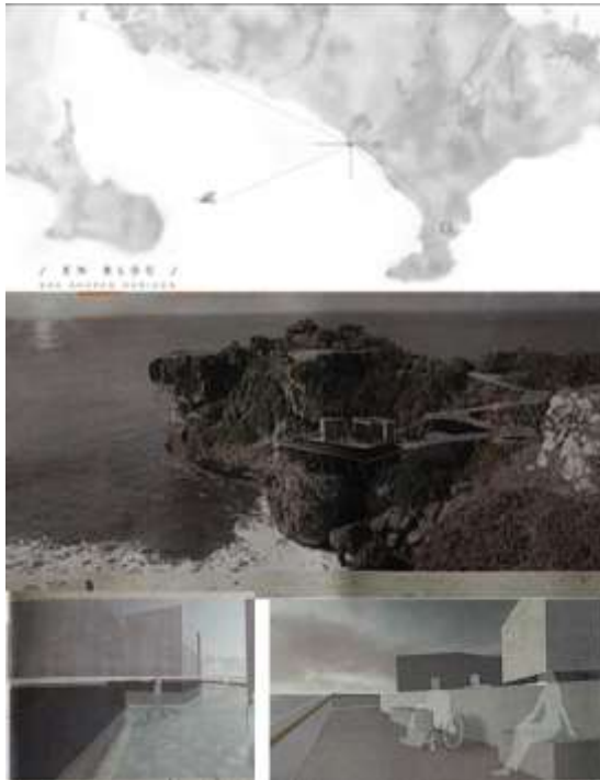
Figure 5. Design work “En Bloc”